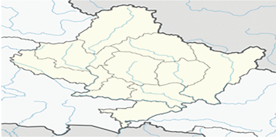
Map of Bhimad Municipality