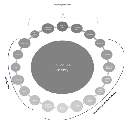
Figure 2: Indigenous Governance Model

Inclusion is a corrective measure of exclusion. It is the method of enhancing the status of underprivileged people on account of their age, gender, disability, race, ethnicity, place of origin, religion, economic status, identity, or another status through strengthening their ability, opportunities, dignity, access to resources, voice, and respect for rights (United Nations, 2016; World Bank, 2013).