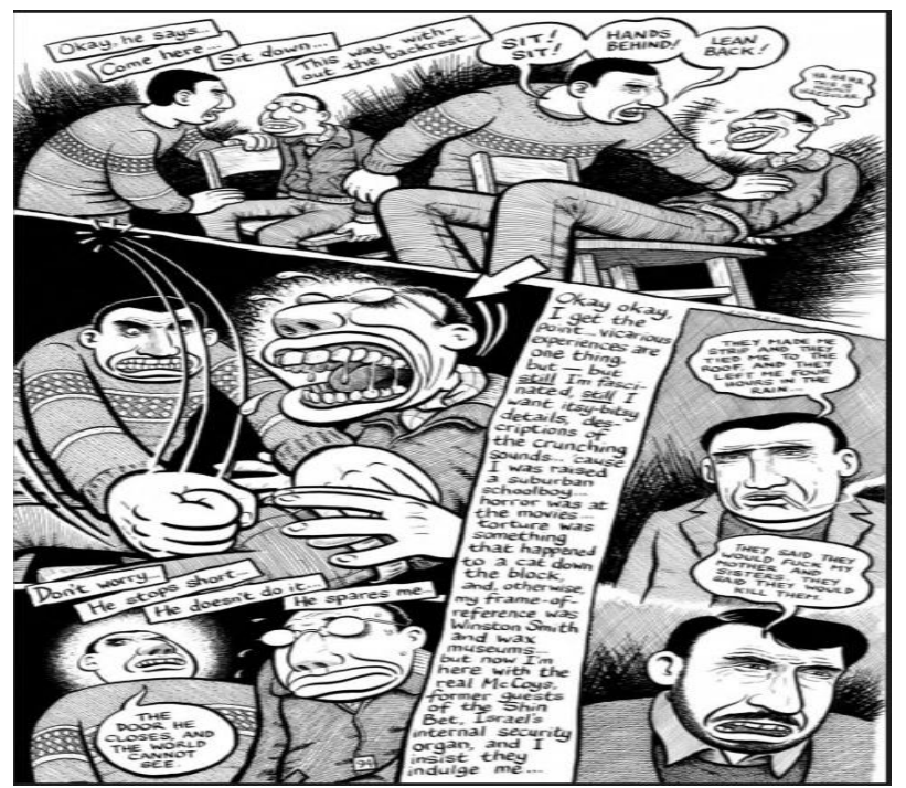
Fig. 8: Exhibition of how the prisoners get corporal punishment, Palestine, p. 94.