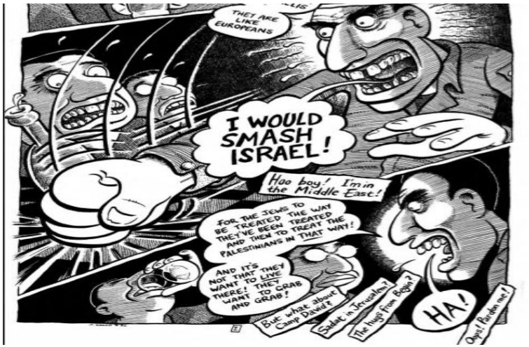
Fig. 1: Rage against Israeli, Palestine , p. 2. SCHOLARS: Journal of Arts & Humanities

The enlarged mid macro panel contains multiple actions in its peak with a primary focus on zoomed face and the pounded fist. A foregrounded Palestinian's agonized face, wide parted aggressive eyes with central pointed retina, powerful bang on the desk, and the rancorous expression from his mouth "I would smash Israel!" (2) uncover the subterranean detestation lies on his heart. The anger is expressed with a reason—an aftermath of a lengthy tyrannical dominance and noticeable discrimination of government between Jews and Palestinians, which it is revealed later on the text.