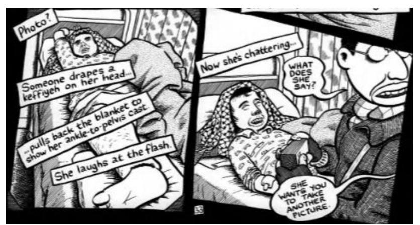
Fig. 3: Contradiction between exposition and real happening, Palestine, p. 33.

The sufferers here are made readily smile at the flashes hiding the pain they endure. The low-spirited girl with multiple fractures who laughs at the flash as shown in the second panel of figure 3 is a typical case of it. However, the first panel, where her fractured leg is at the spotlight, contradicts with the second. The plastered left leg is covered when the reporters took her photo. Along with a keffiyeh over her head, the girl while showing through media on her smiling position never gets depicted with pain, nor does the commoner know about it. In contrast, the captured gesture without ends vividly gesticulate the common practices that the injured does in hospital. Actually, the contradiction between the performance and the reality in the hospital beds in the presence of reporters and photographers is an authentic specimen of how gesture discloses meta-communication.