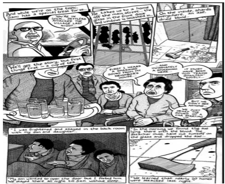
Fig. 10: Settlers' attack on dwellers: the hidden truth uncovered by media, Palestine , p. 64.

Fear sometimes operates directly and so do these startled people who assembled joining the shoulders at night in the fifth panel. The reflection of the windows hole in the second panel and the lying axe with the pieces of window glass and blood droplets in the third and sixth panel facilitate the readers for easy apprehension of such unwanted, yet unfamiliar assault. Afterwards, the settlers again reach to the victims yelling with the harsh words, such as "Get out of your houses dogs," "words about prostitutes and sex words" (65) to charge against the refugees' assumed involvement in raid. In response, the victims are enforced to throw the stones to save their life. This sort of invasion ends with the victims taking to the prison. Moreover, being habituated they are not afraid of going to the prison, "This is a prison for us" (195). The suffocated life inside the fixed territory gesticulate the life in prison. As a jailbird, they have lost almost all freedom. These people who lose control over their gesture under this invisible power act more frantically, as Agamben states, therefore unknowingly they outlet the reality.