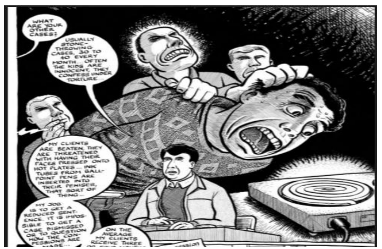
Fig. 6: Moderate pressure to make confess uninvolved crime, Palestine, p. 161.

The overlapped panels in figure 6 demonstrate the ways innocent kids confess under torture. In this image, the artist drags the reader's attention to the blistering iron plate, onto which the young kid's head is pressed vehemently. The loud utterances of denial from his mouth and the resistance to the potent push to approach the hot plate are visible through his facial expression. The speech balloons on the left, furthermore, quote the harsh situation in which the victims confess the unspecified crime.