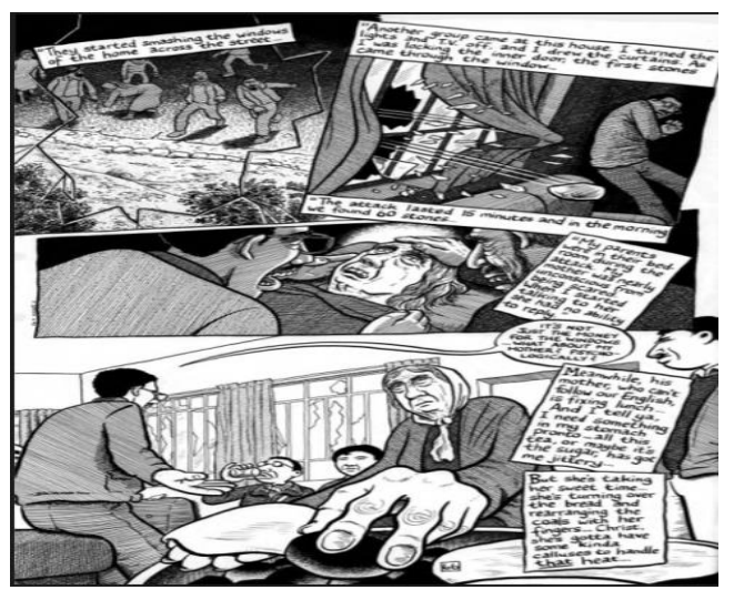
Fig. 5: Physical and psychological suffering of the victims, Palestine, p. 66.

An overextended left hand grasping burning coal in the last panel indicates the numbress of the fingers. It further highlights the level of the victims' tolerance, and also symbolizes the domination of Palestinians under Israeli occupation. Instantaneously, the palm of right hand contains hole in the middle, and thereby lies stiff. Readers, at this moment, can see her unconscious frightened face in the third panel, feel her pain and acknowledge how she is serving lunch to the guest despite of her old age and poor health.