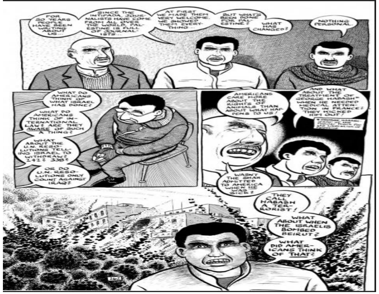
Fig. 9: Informants' queries about the American media, Palestine, p. 162.

Analogous to the case, the Palestinian people share their queries about media reportage to Sacco in figure 9. In the given panels, the facial gestures of inquisitive residents gaudily inquire the surficial unilateral reportage of the American and Western media. These media only broadcasted the events in the choice of Israelis. Refuting this, the elderly people in the panels are rather blaming to Americans for their dumbfounded standing and not depicting the harsh events from the Israeli sides. They divulge that their stories have been written for years; nonetheless, none of the reportage cover the real happenings. Sacco's inability to answer the asked questions, demonstrated in the second panel, also shows the media's biasness.