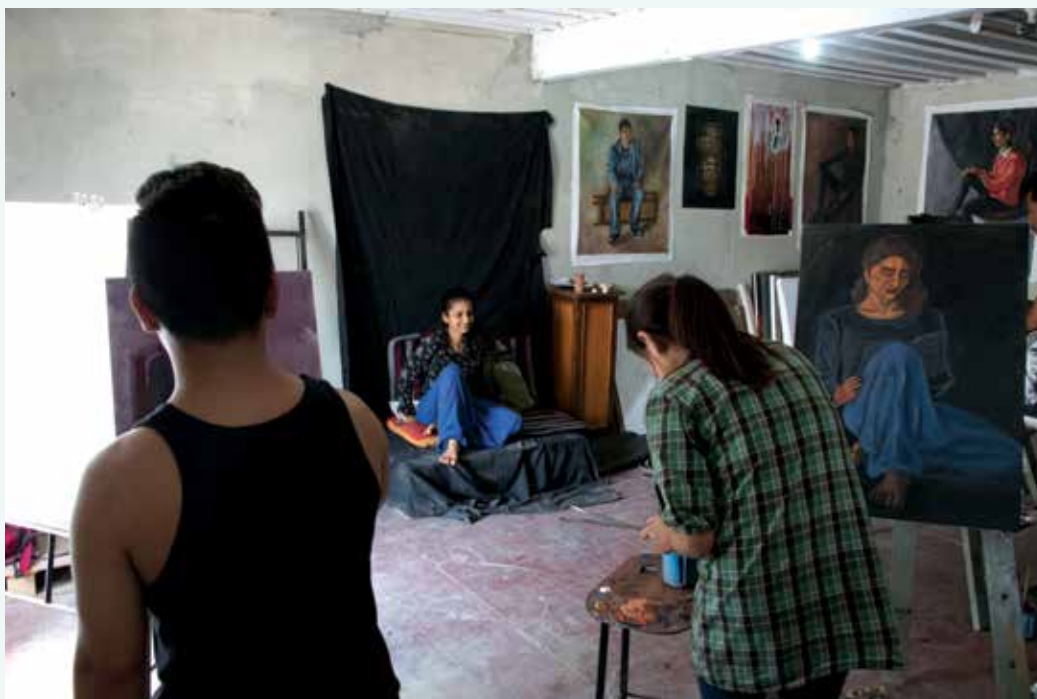
A life study class, BFA 4th Year at Sirjana College of Fine Arts, 2017.

Now the next stage is set to allow the student to cross the sacred line. And here the curriculum of the Master's Program is also designed accordingly. Here, a student is practically left for oneself – in an independent stage to explore with no limits. This stage is called Studio-based class and is run with a minimal guidance of a teacher – described as a mere supervisor. But the supervisor ensures that the student follow all the set norms – so that regardless of the freedom to choose a theme or subject, needed contents and an evolution of individual style to explore, the completed work must reveal or reflect the academic strength behind the student-artist been through the earlier days. In other words, the revelation of accomplished workmanship is a must and remains an important factor.