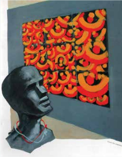
Madan Chitrakar , The Untold , 2007. Acrylic on canvas.

wish to create modern experimental art cannot afford to ignore the stage of 'Academic Learning' to an artist - before really crossing into 'Explorations and Experimentations'. To be familiar and understand the fundamentals of learning in Art is the primary requisite - the basic skills to emulate to natural shapes and forms. Here it's worth remembering a proverbial phrase that to break a rule one needs to know the rules first.