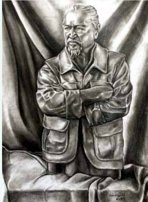
Chiranjivi Shrestha (BFA 3rd Year), A study from a 3D object, 2017. Charcoal on paper.

In the specific terms, the BFA course which has duration of four years is designed like a pyramid in structure – the First year as the flat broad base. And it is followed by the next three years systematically following the elements of knowledge and skills introduced in the base - tapering up to the fourth or the final year as the apex of the pyramid. Here, the essence of dissemination is divided into two broad categories – first the skills – the technicalities of how to draw and later paint. And the second is to observe and follow things as seen by naked