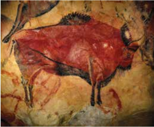
Painting of a Bison , c.15,000 BCE from the Altamira Cave complex , home to some of the earliest art of prehistory, Spain.

by collective beliefs or the needs. Individuality or an individual choice thus, always remained low and mattered least in such an exercise. An art thus, remained subject to several restrictions. Yet it continued to be described as a work of Art. Ancient works from cave art at Altamira to centuries old tradition of religious paintings in Nepal and elsewhere illustrate the point.