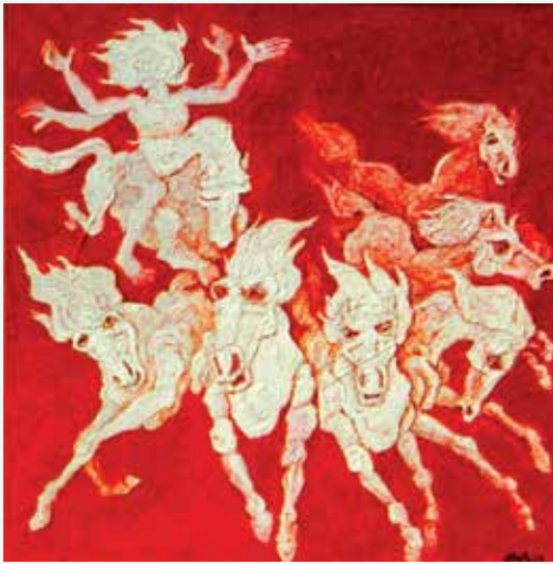
Shashi Shah , Kalki Avataar , 2002. Acrylic on canvas.

obvious an artist needs appropriate tools or elements to convey the chosen message. Here appears the importance of the choice of shapes, forms, colors and also the creative language. It all including the idiom depend upon the chosen motives of an artist.