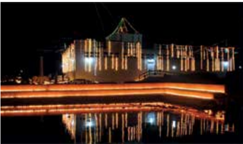
Mayadevi Temple at Night (from LDT files)

UN, at the right time who not only floated the idea of a modern Lumbini but also put it into motion by forming the International Committee for the Development of Lumbini under Nepal's own stewardship. What else could he have done. It was another good fortune to