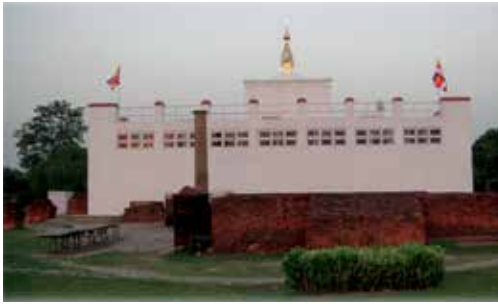
Maya Devi Temple with Asoka Pillar and the pond