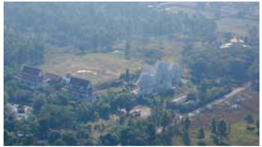
Lumbini East Monastic Zone