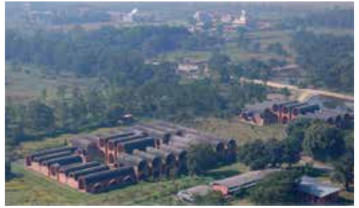
Lumbini Cultural Center