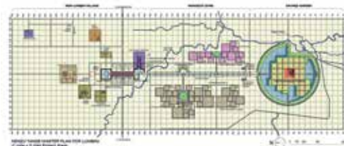
1 mile x 3 mile project area (from UNESCO website)