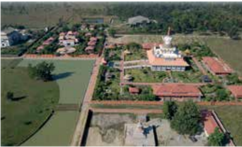
Lumbini West Monastic Zone (from LDT website)