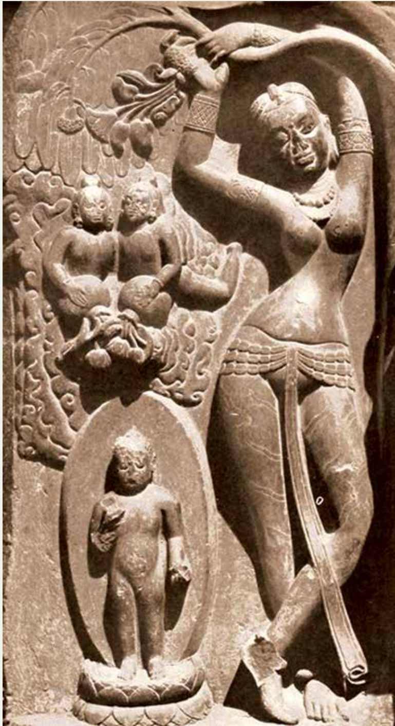
Nativity of Buddha. 9th century CE. Stone. National Museum, Chhauni, Kathmandu.