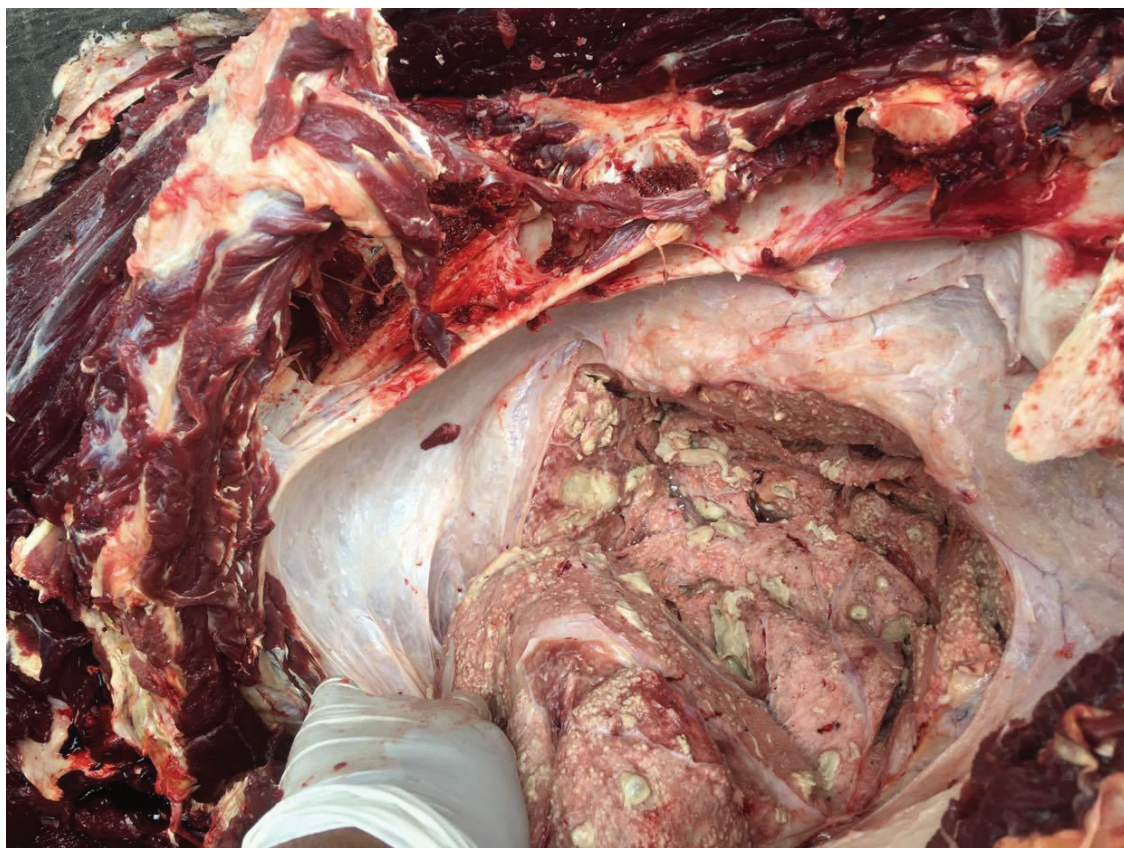
Figure 2. Granulomatous tuberculosis lesion with the caseous mass in the lungs of dead elephants.