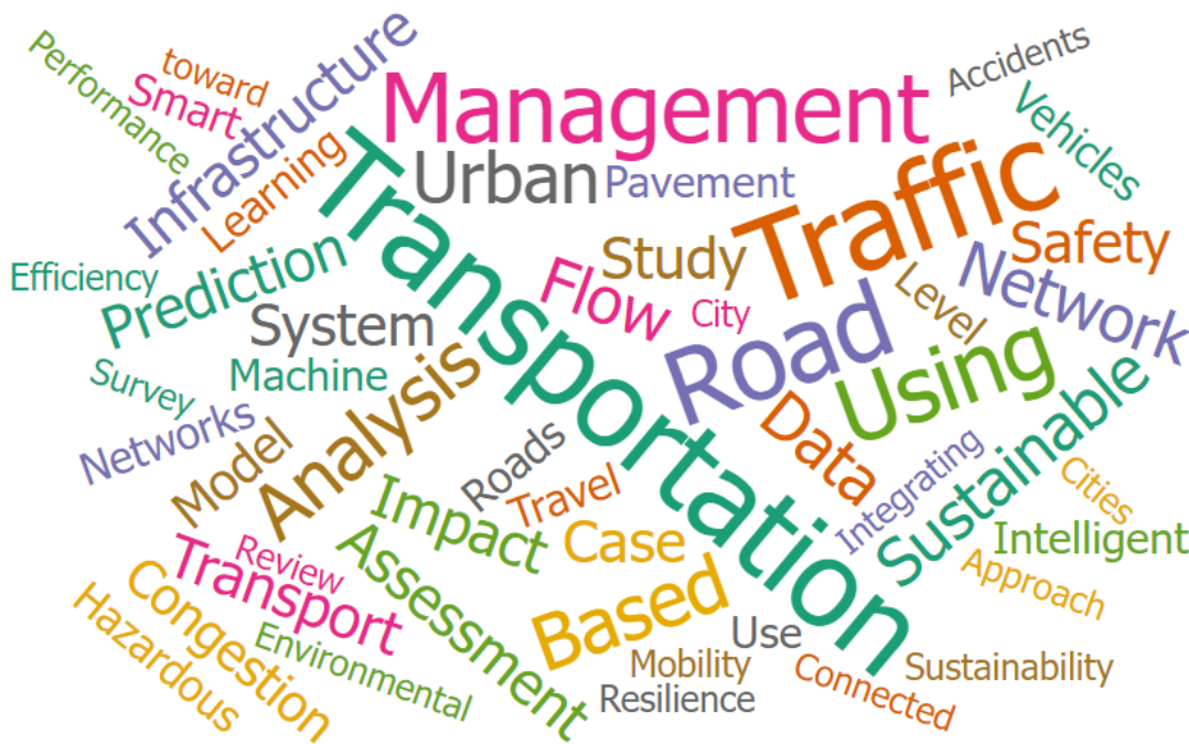
Figure 3: Keywords

In Transportation Management research, keyword usage reveals key areas of focus and interest. The terms Transportation and Traffic are the most prevalent, each appearing 19 times, underscoring their central role in studies related to vehicle movement and system efficiency.