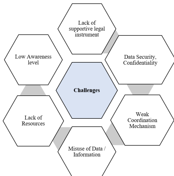
Figure 3: Identified challenges to adopt Integrated Statistical Management System

Integrated statistical management policy and system does have its own share of challenges. Literature have highlighted the case studies of countries that have adopted similar system. Some of the challenges are explained below: