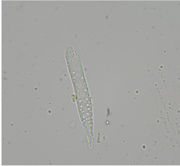
Figure 4. Demodex spp.