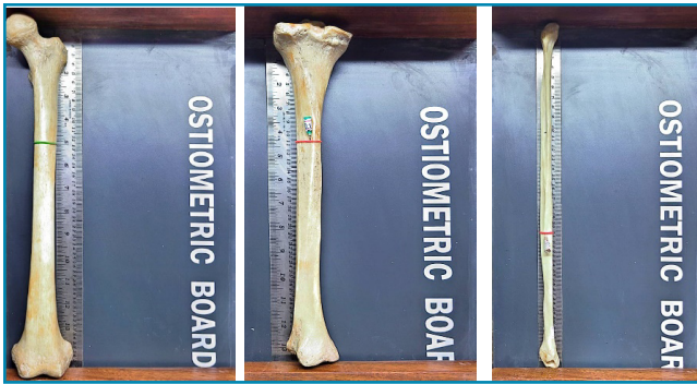
Fig. 2. Determining the length and location of the foramina of the femur, tibia, and fibula