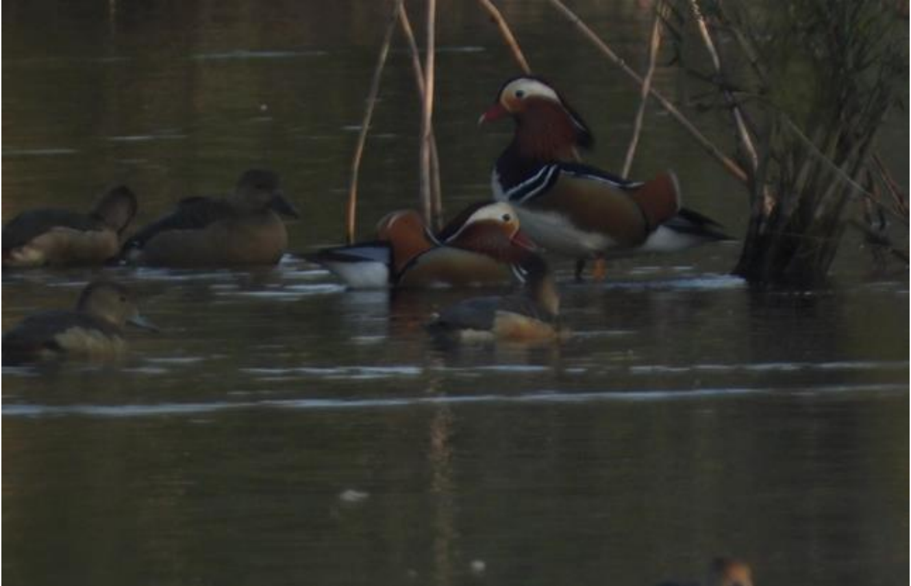
Figure 2. Two individuals of mandarin duck Aix galericulata photographed from Gunde Lake of Lake Cluster of Pokhara Valley.