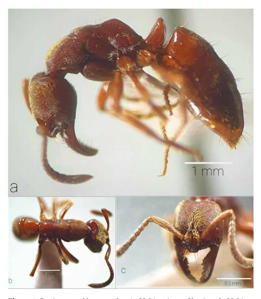
Figure 1. Buniapone amblyops worker (a. Habitus in profile view, b. Habitus in dorsal view, c. Head in full-face view)

Sculpture, pilosity and coloration: Head and mesosoma very finely and densely punctured, sides of mesosoma with regular longitudinal striations. Body with sparsely scattered erect hairs. Head, pronotum and mesonotum with adpressed dense golden pubescence, gaster, antennae and legs with moderately dense pubescence. Body brownish orange in color, more or less uniformly colored.