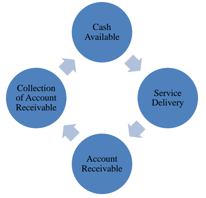
Figure 2: Working Capital Cycle in Service Organizations

Figure 1 distinctly explains the operational cycle of how an organization can move cash from purchasing to collection following sales. The applications of cash begin from the purchasing point of raw material for manufacturing of the items. The purchased raw materials bring into production process and before long it gets work in process from bought raw materials till the finished products or perhaps for all set to sales. When the goods are sold, the account receivables are produced until the cash received. Once again the cycle starts by using cash point as well as conclusion to cash collection.