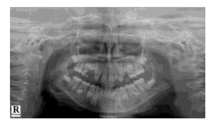
Figure 4: Panoramic radiograph with peg shaped 12 and 22