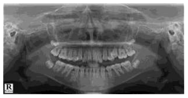
Figure 1: Panoramic radiograph of a patient with dens-in-dente with respect to 12 and missing 22

based on mutual consensus. The data was entered in Microsoft Excel 2019 and analyzed in Statistical Analysis for Social Science (SPSS) version 25(IBM, Chicago, US). Crosstabulation were done using descriptive statistics. Chi-square test was used to compare the prevalence of dental anomalies based on gender.