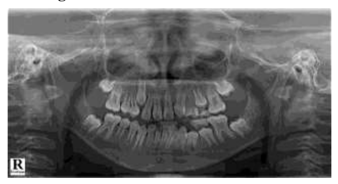
Figure 2: Panoramic radiograph of a patient with supernumerary tooth in maxillary anterior region