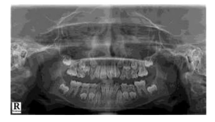
Figure 3: Panoramic radiograph of a patient with rotation wrt 22