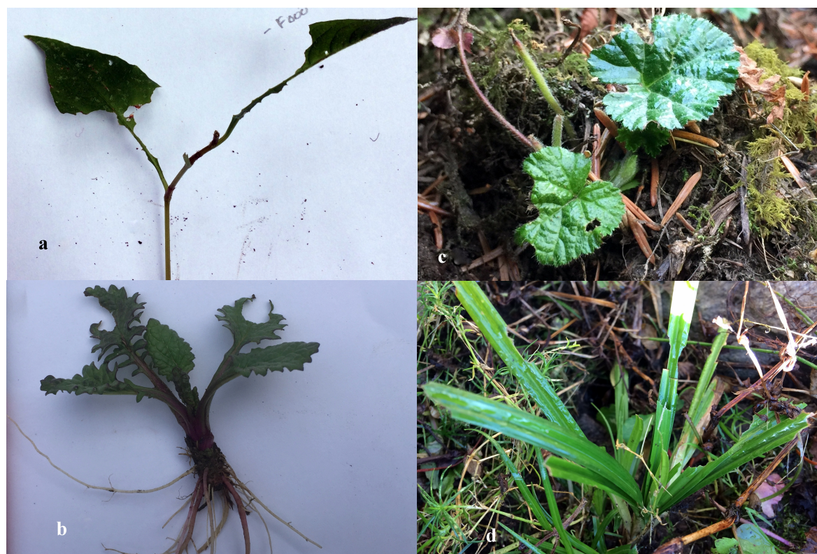
Figure 3 Pika foraged plant species (a. Persicaria sp., b. Senecio sp., c. Rubus sp., d. Aletris sp.)

Pika density in a study in the Mount Everest region was accounted for 12.5 individuals/hectare (Kawamichi, 1968) and 14 individuals/hectare in the Langtang National Park (Koju et al., 2013). Two separate studies in the different years 2012 and 2013 in the Api Nampa Conservation Area accounted for pika density of 7.2 individuals/hectare and 8 individuals/hectare (Koju & Chalise, 2013). The pika population density in the Parvati Kunda groundwater complex area was accounted 6 individuals/hectare. The population density in the Parvati Kunda Groundwater Complex area is relatively low compared with the population density reported in other areas.