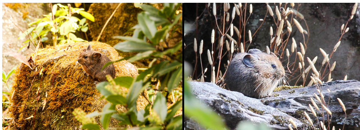
Figure 2 Royle's Pika observed in the periphery of Parvati Kunda Wetland (2605 m asl)