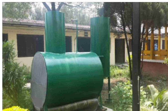
Figure 1 Jeeban's model biogas plant

The urban biogas plant has fixed digester and its capacity is 1,275 litres (Fig. 1). For total trapping of gas, biogas plant was insulated with plastic sheet and glass wool (Fig. 2).