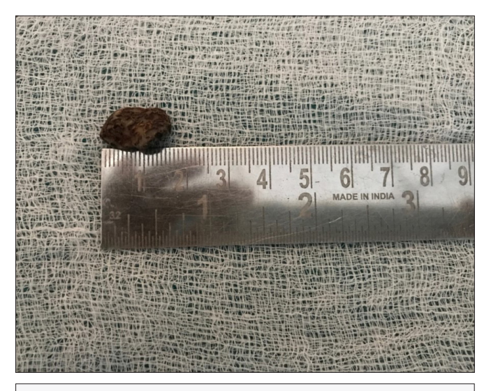
Figure 4. Removed Foreign body.

1.5mg/kg iv was used for relaxation. Total duration for foreign body removal was less than 2 minute. After removal of the foreign body, oral suctioning was done, positive pressure ventilation was given. When became fully conscious, oxygen was given with face mask to maintain saturation.