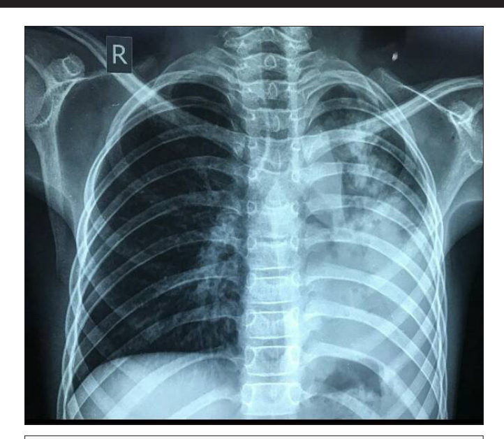
Figure 1. Heterogeneous radio dense opacity with air bronchogram within left upper and mid zones, Homogenous radio dense opacity in left lower zone with no air bronchogram, Tracheomediastinal shift towards left side.