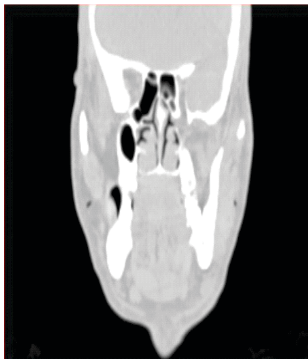
Figure 1a,b : Axial and Coronal CT scan of face and neck : Multiple air foci are seen in bilateral stenson's ducts and parotid glands.