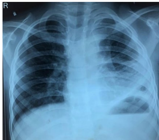
Figure 2: Skigram chest showing resolution after streptokinase treatment

USG guided aspiration could aspirate 100ml of fluid. Pleural fluid was exudative with lymphocytic predominance. (Protein 1.2gm/dl, Glucose 100 mg/dl, Cell count: 1020 cells/Cumm, DLC- lymphocyte 80%, polymorphs- 20%). Smear microscopy did not reveal any pathological organisms including Acid Fast Bacilli (AFB). Pleural fluid was negative of malignant cells. In view of multiloculated pleural effusion fibrinolytic therapy was planned, as there was no contraindication to such therapy. Streptokinase 15000 units/kg (Total 3,00,000 units) in 50ml normal saline was instilled into pleural space through chest tube. Position of patient was changed frequently to allow even distribution of the drug in the pleural space. Clamp was removed after one hour and drainage was subsequently collected and measured to be 300ml, 25ml and 25ml every day for next 3 days. The same dose of streptokinase was repeated after 72 hours. This time the drainage was 335ml, 75ml, 75ml and 45 ml every day for next 4 days. Serial chest x-ray and ultrasound chest were done to evaluate the treatment response. The adjunctive fibrinolytic treatment resulted in complete resolution of empyema in 10 days post pigtail insertion (Figure 2).