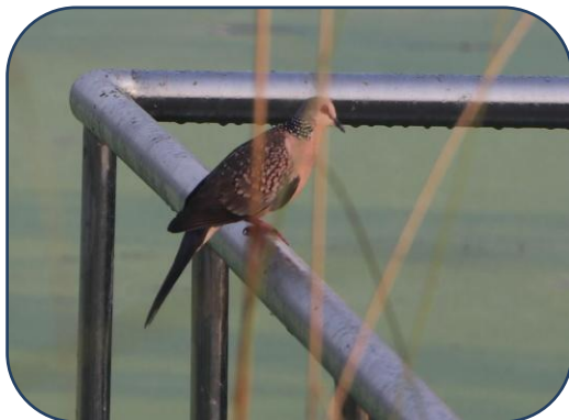
Figure 13 : Spotted Dove