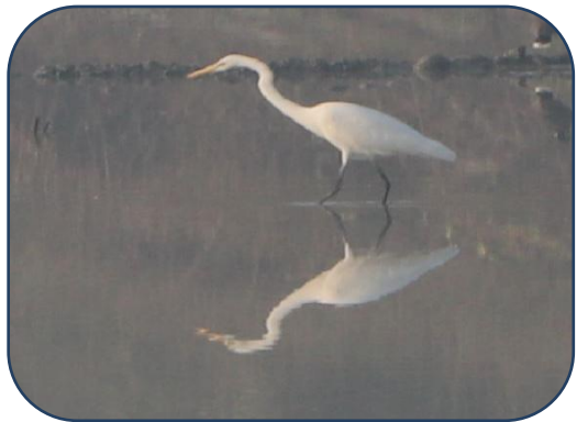
Figure 18 : Great egret