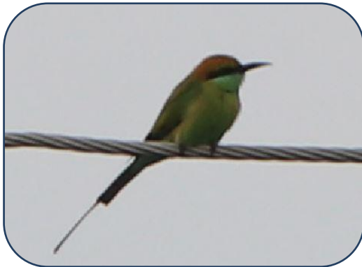
Figure 1: Asian green bee-eater