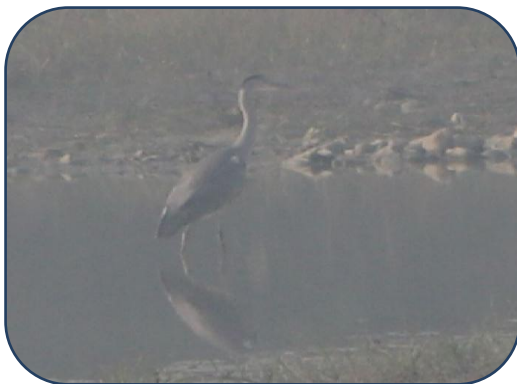
Figure 19 :Great blue heron