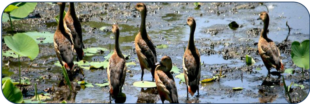
Figure 26: Lesser whistling duck