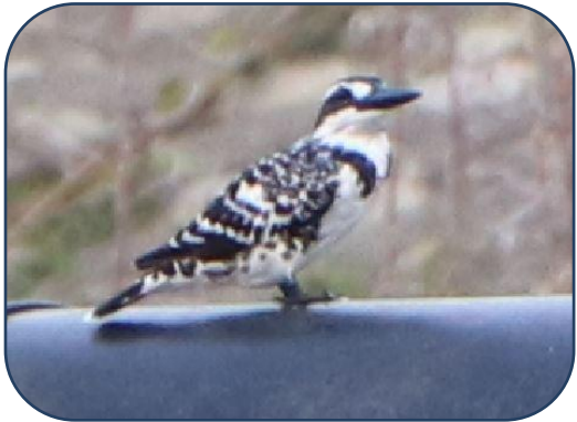
Figure 2: Pied kingfisher