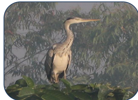
Figure 14 : Grey heron