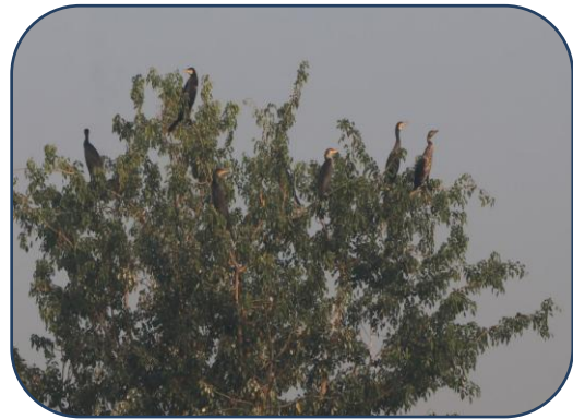
Figure 12 : Great cormorant