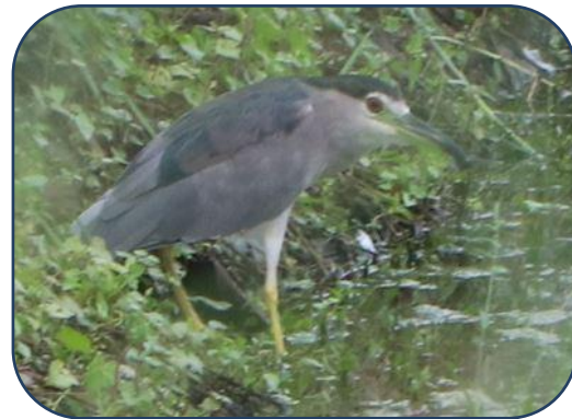
Figure 4: Squacco heron