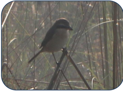
Figure 22 : Great grey shrike