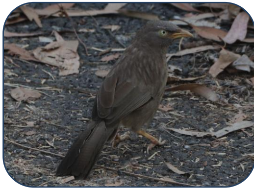
Figure 11 : Jungle babbler