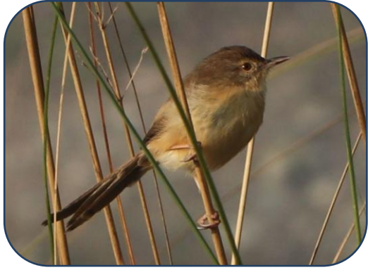
Figure 23 : Plain prinia