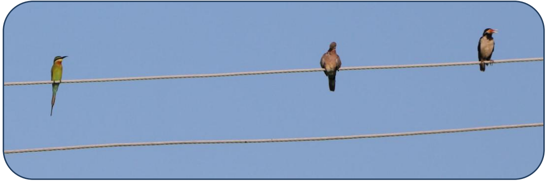
Figure 27: Asian Pied Starling (Right side of Image)