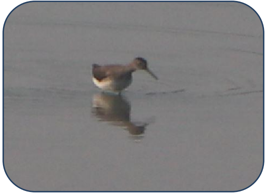
Figure 16 : Common greenshank