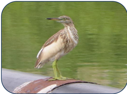
Figure 3: Black-crowned night heron