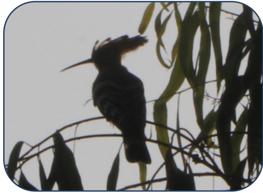
Figure 21 : hoopoe