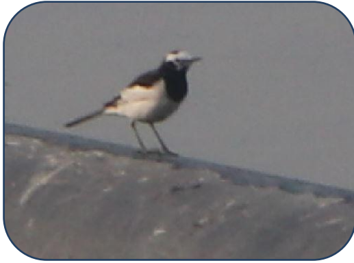
Figure 15 : Black-backed wagtail