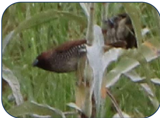
Figure 5 : Scaly-breasted munia