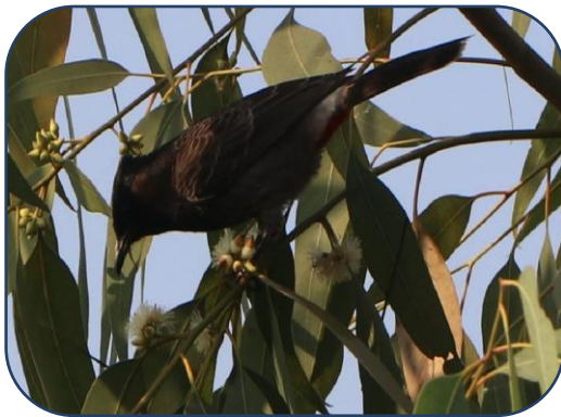
Figure 17 :Red-vented bulbul