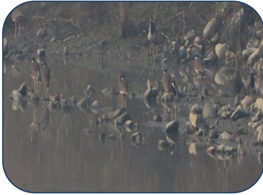
Figure 24 : Red-wattled lapwings