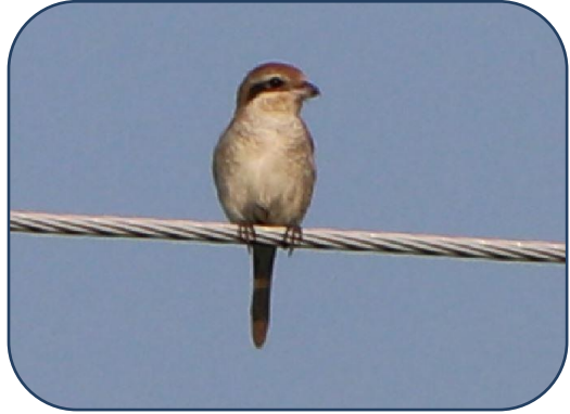
Figure 10 : Isabelline shrike