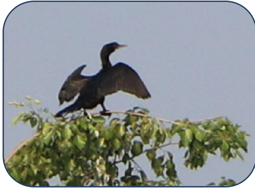
Figure 9 : Neotropic cormorant