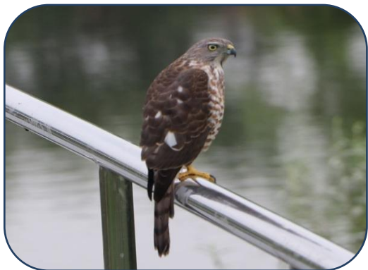
Figure 6 : Shikra