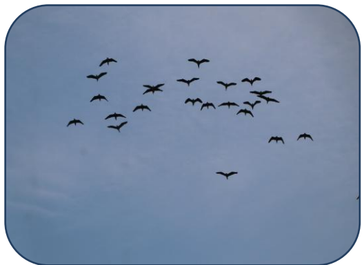
Figure 20 : Cormorants Flying Over Camargue