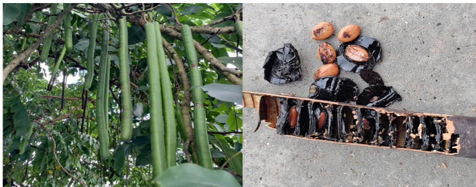
Fig 3: Pods, seeds, pulp and fruit of cassia fistula linn

Local medicinal uses: In ayurvedic medicine, rajbriksha is also known as disease killer. Rajbriksha has many medicinal uses such as laxative, purgative, cooling, anti-inflammatory, anthelmintic, antiperiodic, febrifuge, diuretic and tonic. It is used in various medicinal treatments like skin diseases, ringworm affections, dry cough, cardiac problems, diabetes, constipation, bronchitis, fever, stomach disorder, malaria, leprosy, burning sensation etc.