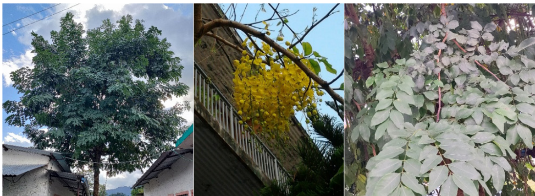
Fig 2: Tree, Flowers and Leaves of Cassia Fistula Linn