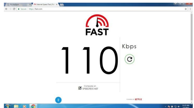
Fig. 3 Internet speed of second user (testing using speed Tester)