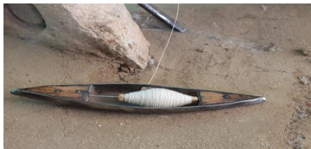
Figure 4: Shuttle carrying the weft yarn

NAAV (Shuttle): Shuttle is the device used to carry the weft yarn across the width of the fabric. It is generally made of wood and has notches at the end to hold the weft. Gatti is a bobbin used to wound the weft yarn and is located inside the shuttle as shown in the Figure 4.