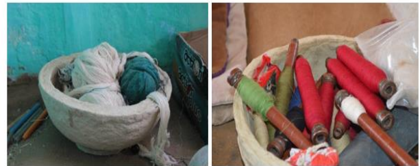
Figure 1: Extra weft yarn used for Pattu weaving

Traditionally 'Pattu' weaving was used in making shawls and blankets by using sheep or camel wool in its natural unprocessed was collected using razors (Jaipal, 2020). This collected wool was deep brown or warm white in colour. Pattu made from natural wool was sturdy and thick enough to help people to withstand the hard climatic conditions of the deserted areas. Earlier, to convert the wool fibres into yarn, spinning was done by local communities on spinning wheels known as Charkha which were then woven into fabric by weavers of the Meghwal community. Currently wool is procured from spinning mills and given to the weaver for Pattu weaving. The raw wool used initially has been replaced by cotton, merino wool, or their blends like polycotton, poly wool etc. With the decline in the demand of woollen Pattu and onset of much softer machine-made shawls, weavers switched to cotton which is favourable for all seasons and cost-effective as well. Cotton has been used extensively to make a variety of contemporary products which helps in catering the wider market segments. Figure 1 shows the extra weft yarns used for making motifs in Pattu (Johnson, 2015).