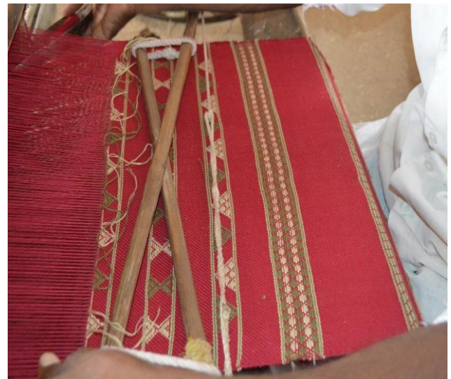
Figure 7: Making of Pattu on pit loom with insertion of extra weft for creating motifs

The weaver sits on their seat situated behind the pit. Keeping his legs inside the pit to press the treadles for giving movements to attached heald frames and make shed as per the requirement of weave followed by weft insertion. Then, reed is used to beat the weft towards the fell of the cloth to tighten and secure the weft in the completed fabric. The extra weft yarns wound on Nali are used to create different geometrical motifs as per the design as shown in figure 7. The extra weft yarns passed between a minimum of two and a maximum of twelve picks during weaving to avoid larger floats. Warp yarns are lifted manually to place an extra weft for interlacement. Process of making Pattu fabrics requires patience, persistence and close attention to details. Different colors and weaves are used to create varieties of Pattu. Generally plain or twill weaves are used as a ground weave to form the base cloth and motifs are made by using extra weft yarns of contrasting colours as compared to plain background of fabric (Marks, 1986).