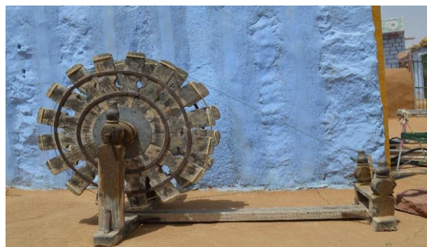
Figure 5: Charkha for yarn spinning

Charkha is a manually operated spinning wheel which includes a belt and wheel rotating system as shown in figure 5. A spinner takes a handful of fibres, teases it and holds it in one hand while using the other hand to twist the fibres that results in the formation of the yarn. A continuous twisting and pulling motion are carried out to make the yarns longer and longer to acquire necessary thickness. The charkha is rotated in a clockwise direction, which helps control the release of the quantity of fibre required for spinning. The amount of twist required can be controlled by the size of the wheel used. Traditionally camel or sheep wool was locally collected and was hand spun into yarns by the women of the house. However today, already spun and dyed cotton or wool yarn is provided to the weavers by the NGO 'Urmul' that is associated with the craft.