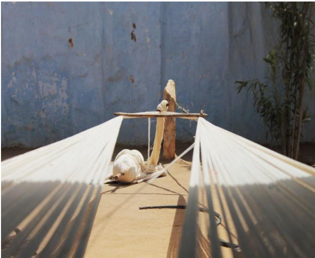
Figure 6: Warping process done in a traditional manner

The warp is prepared in a large open space. A number of lease rods are planted in pairs according to the length of the warp required for fabric weaving. The warping starts from the iron lease rod at one end and is taken to the small lease rod at the other end, passing criss-cross in between all the pairs. Figure 6 shows the warping process done in an open space in the traditional way.