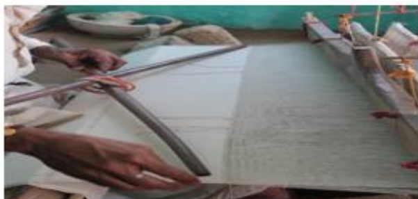
Figure 2: Making of Pattu on pit loom showing the sitting position of the weaver

Different parts of the pit loom along with their functions are discussed below to understand the mechanism in detail. The Names of parts are also mentioned in local language wherever possible, to retain the essence of craft.