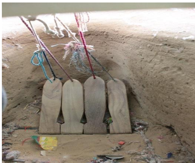
Figure 3: Treadles inside the dig to give movement to the heald shaft

PANSAR (Treadles): Treadles are pedals located at the bottom of the loom inside the pit which is shown in the figure 3. Four Treadles, each six inches in length and four inches wide are used to help control the warp shed formation by allowing the up and down movement of the shafts followed by insertion of weft to create the desired pattern.