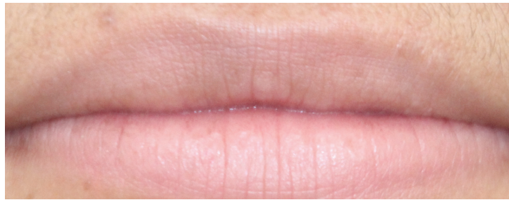
Figure 1: Lip photograph showing the lip prints.

(Canon EOS 60D) with a tripod stand to reduce the chances of obtaining blurred photographs. For analysis central portion of lower lip (10 mm wide) was considered, as this area is always visible even in small fragment and also due to numerical superiority of lines in the area of study. 6 The classification given by Suzuki and Tsuchihashi was used to further classify the lip patterns. 7