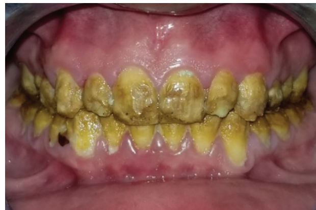
Figure 2: Overjet and overbite