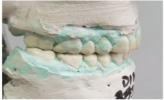
Figure 4: Mock up