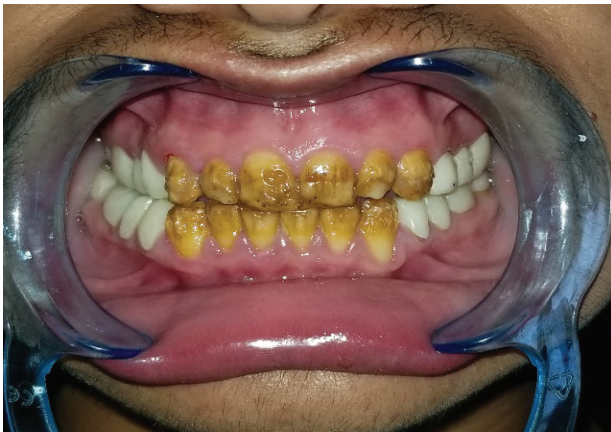
Figure 5: Posterior provisional restoration