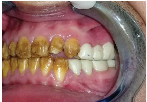
Figure 6: Raised vertical dimension