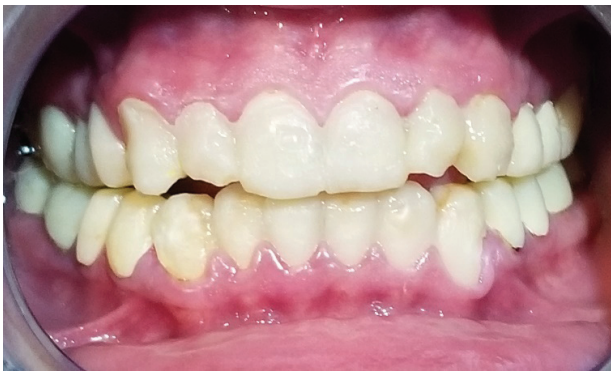
Figure 7: Complete provisionalization