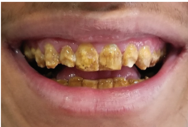
Figure 1: Hypoplastic, discolored, pitted dentition

Patient was recalled after 2 weeks for final impression. Teeth were restored with porcelain fused to metal crown in upper and lower posterior teeth. Occlusal correction was done in both centric and eccentric movements. On later appointment, lithium disilicate full veneer crown was placed in anterior teeth using self adhesive resin cement (Figure 8). Canine guided occlusion was given to the patient. Patients' functional and esthetic rehabilitation was done (Figure 9). Patient was given oral hygiene instruction and advised to follow up every 6 months.