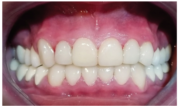
Figure 8: Lithium disilicate and PFM crowns