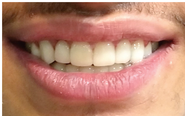
Figure 9: Patient smile