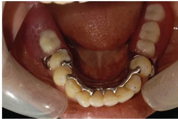
Figure 6: Final prosthesis in situ