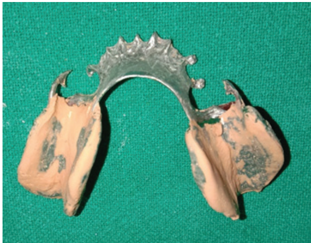
Figure 3B: Final impression with zinc oxide eugenol paste