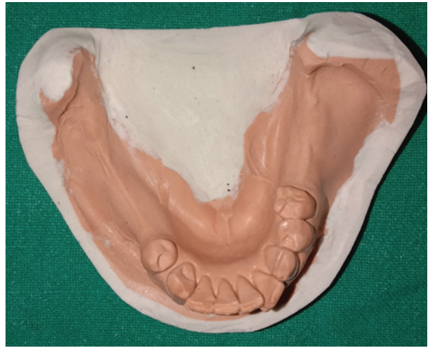
Figure 2C: Master cast after mouth preparation