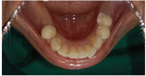
Figure 2A: Intra oral view after mouth preparation