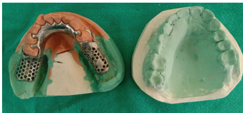
Figure 4D: Corrected cast with metal framework