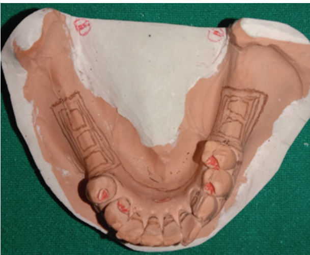
Figure 2D: RPD designing in master cast