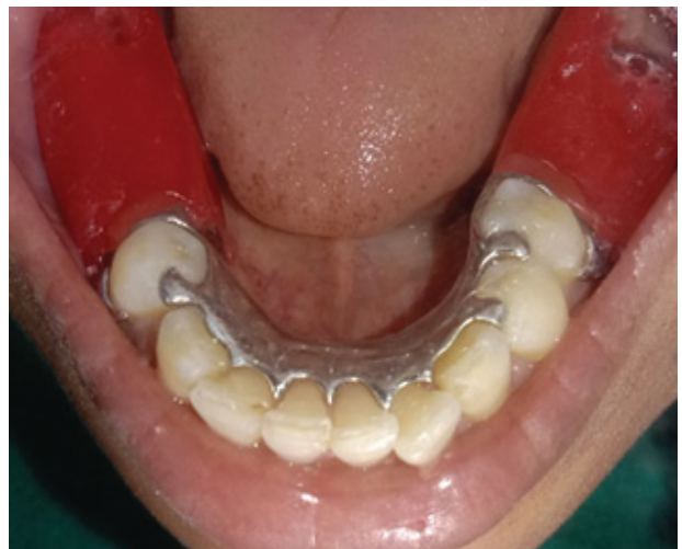
Figure 3A: Metal framework with occlusion rim checked intra orally