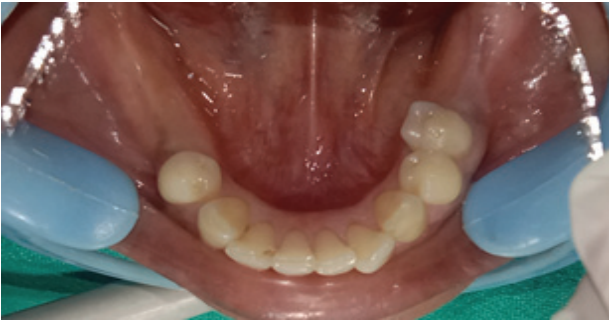
Figure 1: Intra oral view