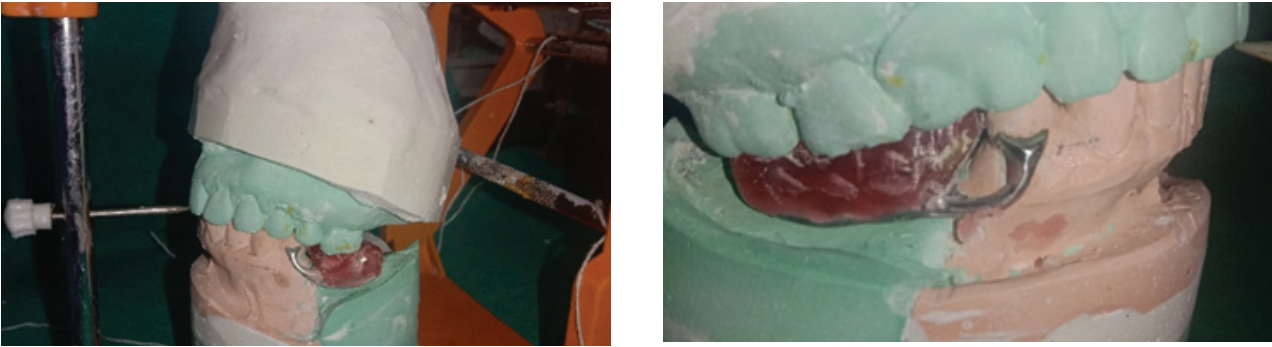
Figure 5: Articulation (Right and Left view)