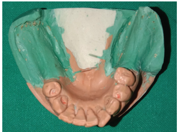
Figure 4C: Corrected cast obtained