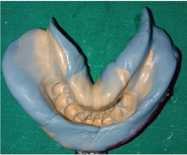
Figure 2B: Impression after mouth preparation