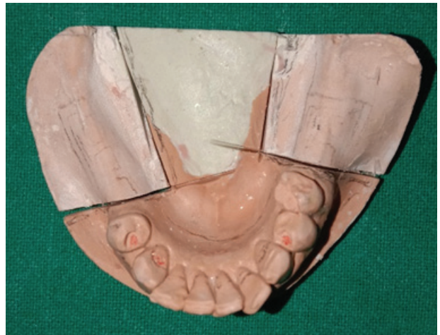
Figure 4A: Casts with two saw cuts perpendicular to each other