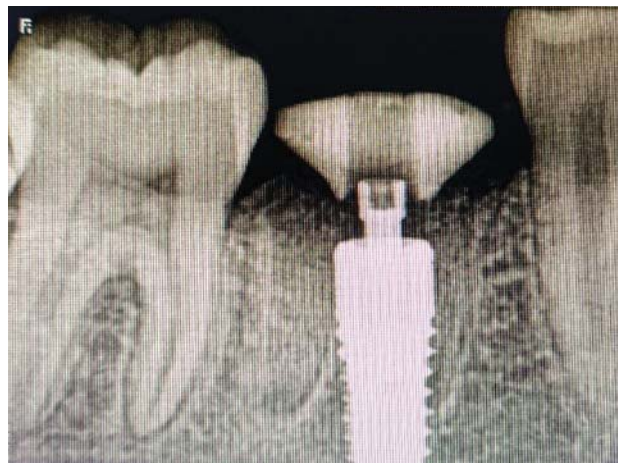
Figure 8: Radiograph after placement of gingival former