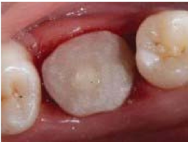
Figure 7: Customized gingival Former