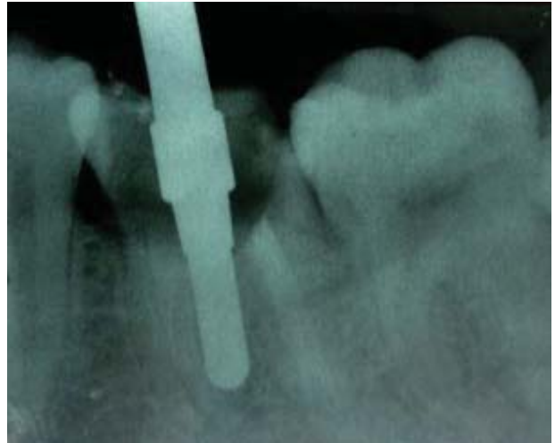
Figure 4: Radiograph with guiding pin