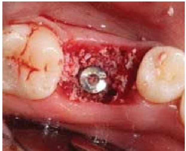
Figure 6 Placement of implant and Bio Oss in osteotomy site