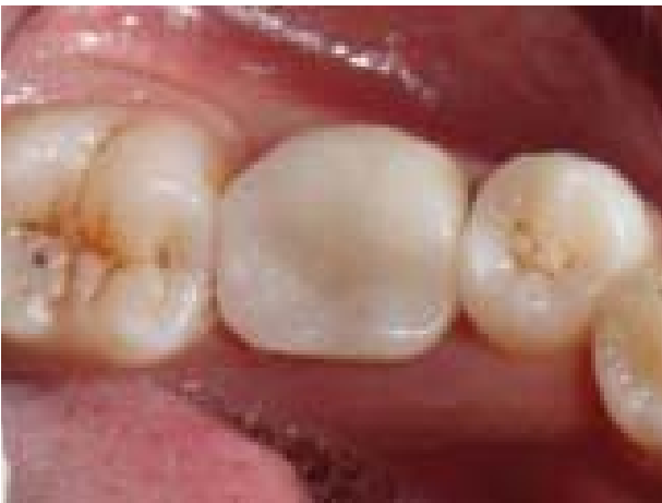
Figure 11: Screw retained all ceramic crown in place