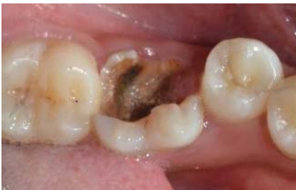
Figure 1: Grossly decayed 36