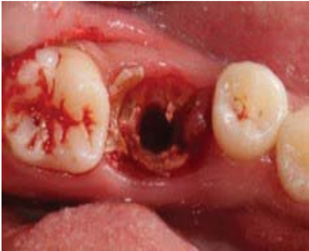
Figure 3 Osteotomy between the roots