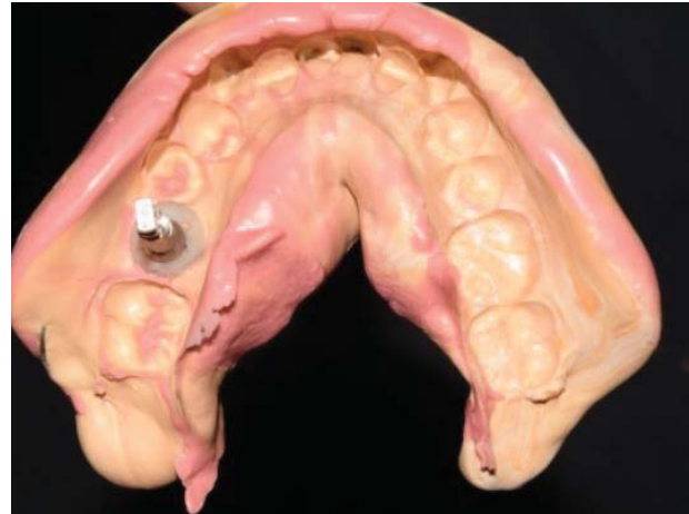
Figure 10: Impression using close tray technique