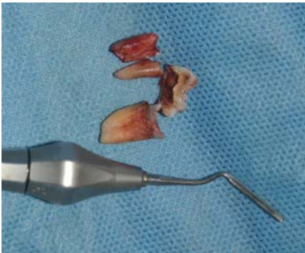
Figure 5 Extraction of tooth using periosteal elevator