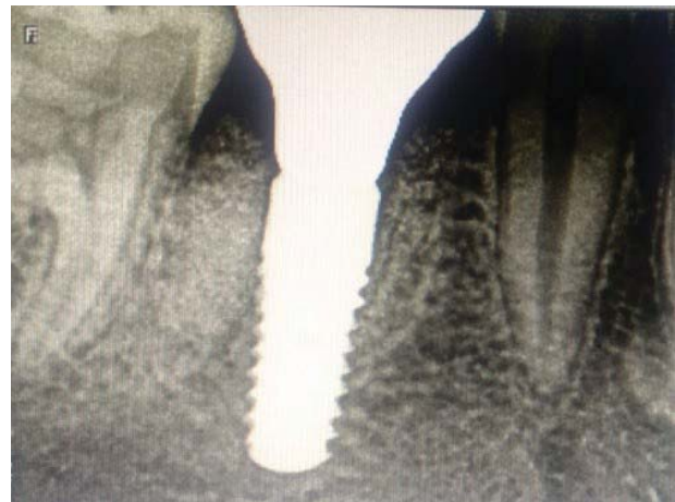
Figure 12: Radiograph after placement of Implant crown