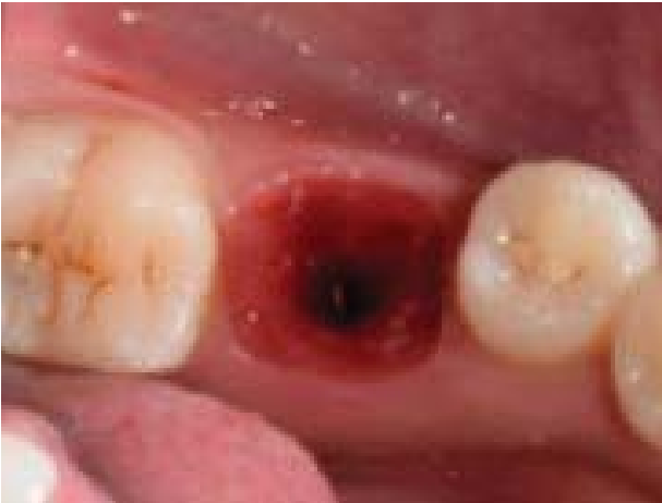
Figure 9: Soft tissue profile after healing