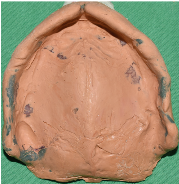
Figure 3. Posterior overextension of the impression material