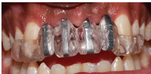
Figure 8: Try in of the radiographic stent before CBCT scan