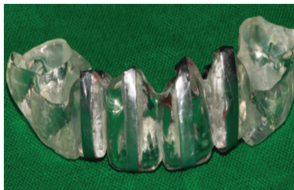
Figure 7: Circumference radiopaque indicator lead strip outlining the tooth over the implant site