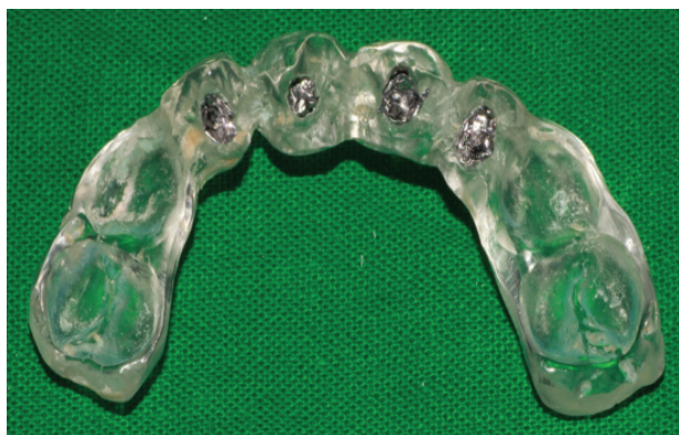
Figure 6: Radio opaque material embedded in the drilled holes