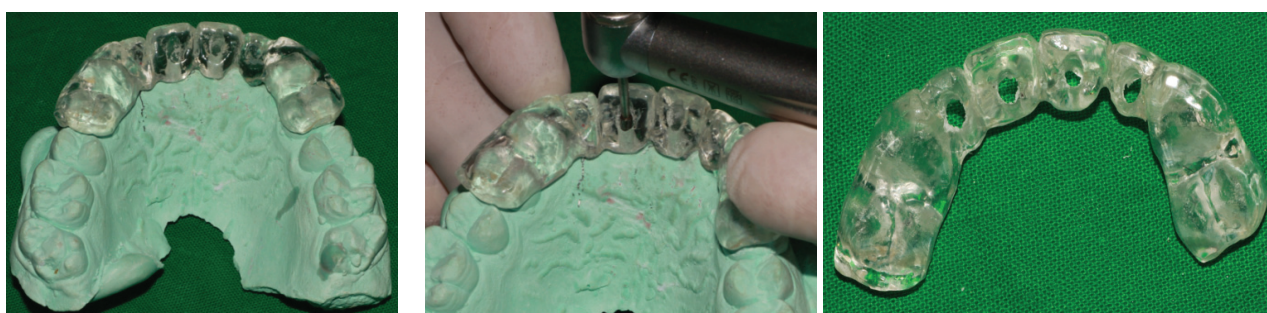
Figure 3: Wax pattern processed with heat polymerizing clear acrylic resin