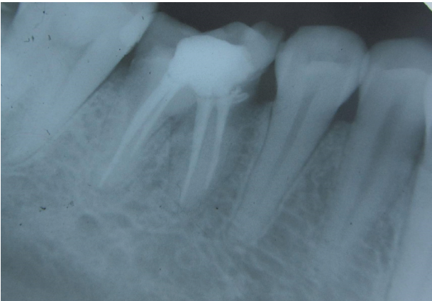
Figure 2: IOPA view of fractured mandibular right first molar