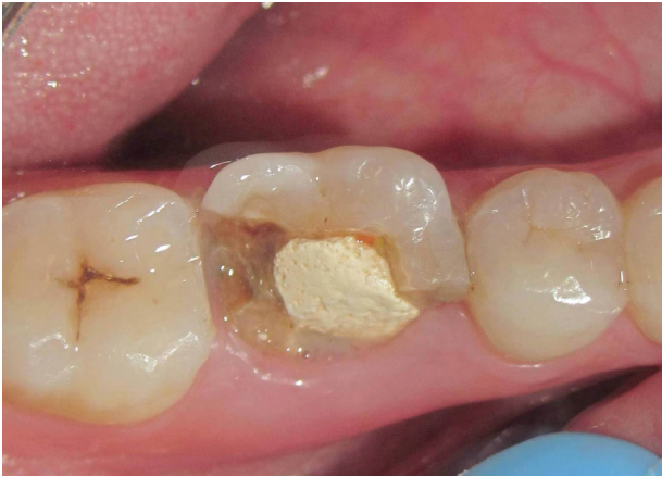
Figure 1: Fractured buccal portion of lower right first molar