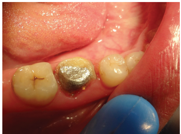
Figure 6: Metal post cementation