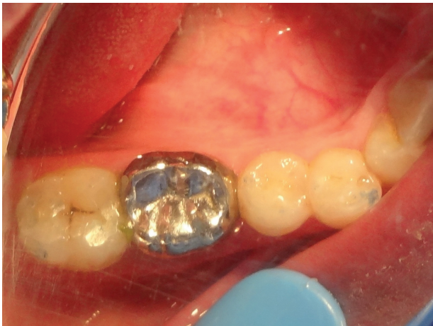
Figure 7: Metal Crown Cementation