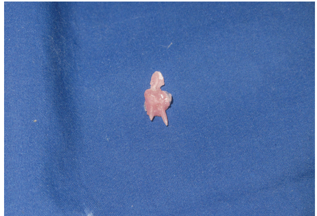
Figure 5: Direct post pattern fabrication