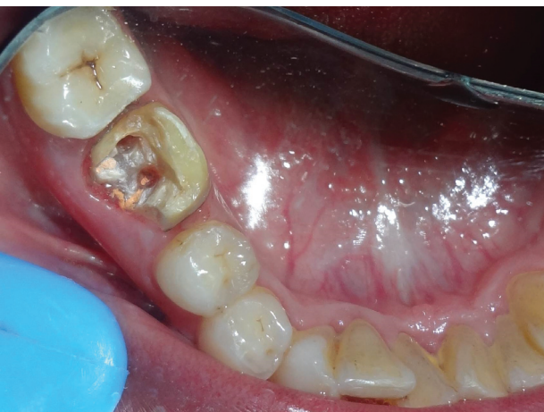
Figure 3: Post space preparation