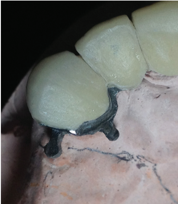
Figure 5: Close up view of male component and lingual shoulder