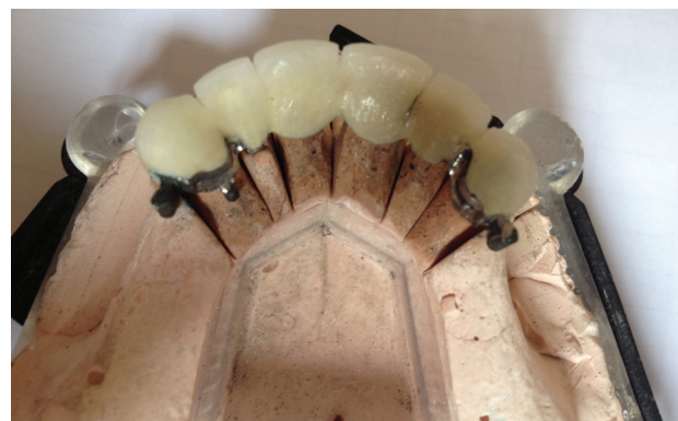
Figure 4: PFM bridge before ceramic trial