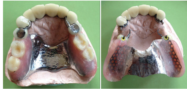
Figure 9 & 10: After processing of the denture