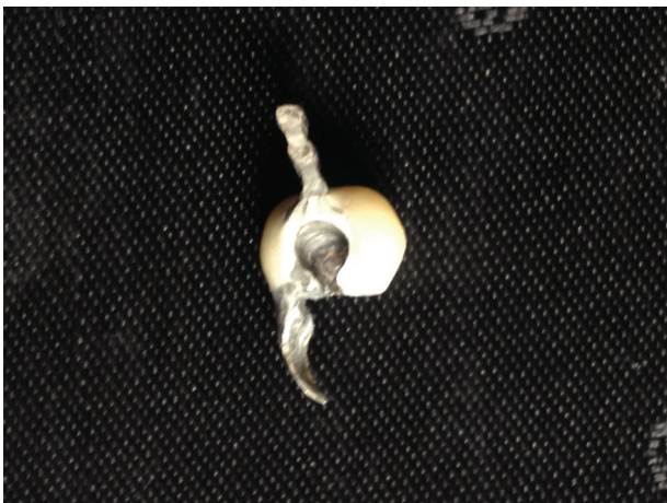
Figure 6: Female housing with lingual bracing arm