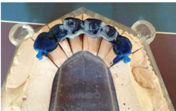
Figure 3: Wax up of maxillary anterior bridge with male component (Preci Vertex)