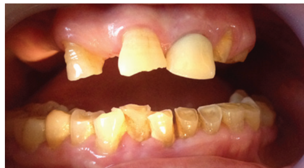
Figure 1 & 2: Intraoral pre-operative view