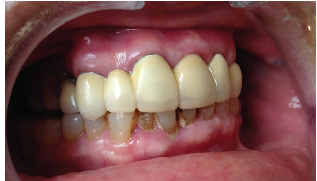
Figure 11: Post operative view with all components in the mouth