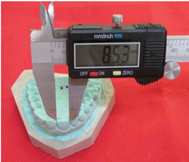
Figure 2: Measurement of width of central incisor