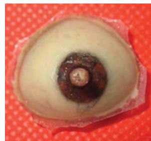
Figure 5: Laminate of clear acrylic over painted sclera blank