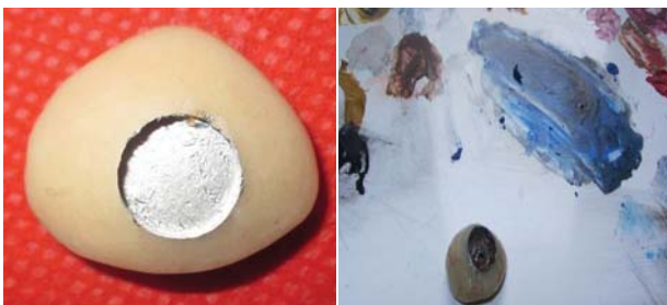
Figure 1: Heat polymerized acrylic resin scleral blank