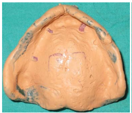
Figure 4: Maxillary final impression