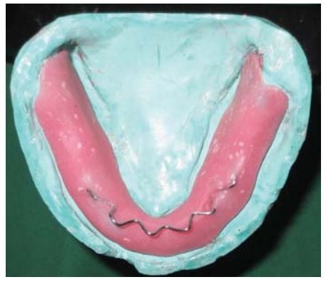
Figure 7: Temporary denture base with metal wire