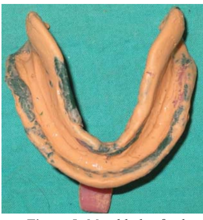
Figure 5: Mandibular final impression