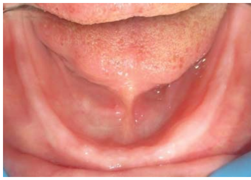
Figure 3: Mandibular edentulous arch