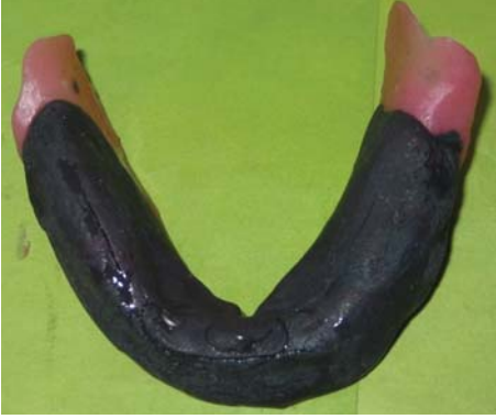
Figure 8: Impression molded in neutral zone