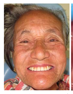
Figure 1: Patient with previous denture

After the trial dentures were deemed satisfactory, the dentures were finished, polished and inserted into the patient's mouth (Fig.13). Thus fabricated dentures were esthetic, retentive as well as stable. The patient was comfortable as well as satisfied with the new dentures (Fig. 14).