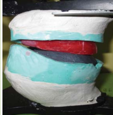
Figure 9: Molded occlusion rim verifying OVD