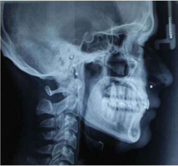
Figure 1: Lateral Cephalometric Radiograph with the metallic balls adhered to the superior border, middle point and inferior border of tragus and lower border of ala of nose