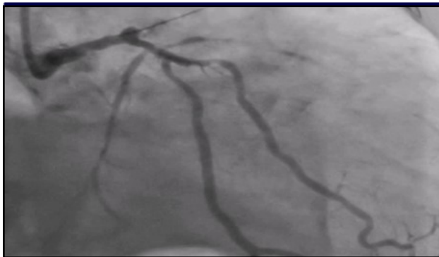
Figure 1. Wire crossed across the lesion in LAD.