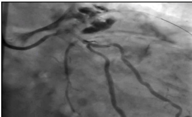
Figure 2. Coronary artery perforation (Ellis type III)