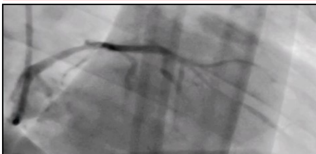
Figure 3. Left anterior descending artery coronary artery perforation sealed with covered stent.

to use covered stent was made and a covered stent (of size 3*30) was used. After deployment of covered stent, perforation was sealed and TIMI grade 3 flow was achieved distal to lesion. Echocardiographic evaluation was continued every 15 minutes during and 3 hours after procedure. No features of significant pericardial effusion or cardiac tamponade were noticed. Patient was shifted to CCU and was started on guideline directed therapy with Dual antiplatelets, HMG CoA reductase inhibitors, Beta blockers and Angiotensin receptor blockers were introduced subsequently during hospital stay. Further hospital stay was uneventful, and patient was discharged on day six of admission. On Follow up, after one week, one month, three month patient was doing fine. His Echocardiographic evaluation revealed no evidence of pericardial effusion.