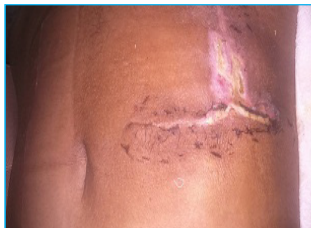
Fig. 4 Post discharge picture