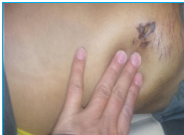
Fig. 1. Showing hernial defect before exploration

His hemoglobin was 15.4 gm/dl and rests of the haematological profiles were within normal range. Skeletal survey did not reveal any bony injury. Focus ultrasound of the abdomen revealed no free fluid in abdominal cavity. Routine urine examination also showed negative for blood. As CT is not available in our hospital, we suspected of local hematoma. As the swelling is cystic in nature, reduced on given-pressure and USG negative for local collection over swelling area, a high index of suspicion of hernia due to trauma was made. A final diagnosis of TAWH was confirmed after the exploration (Fig. 2).