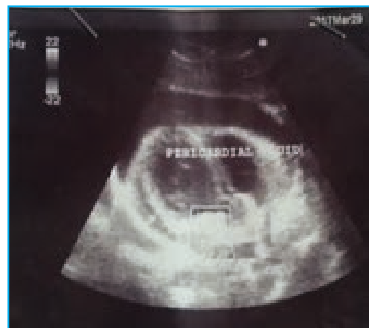
Figure 1. Ultrasound scan of heart showing fluid collection in the pericardial space

During follow up with the antitubercular treatment, patient was found to be clinically improving and became afebrile with improvement in clinical symptoms of dyspnea and had weight gain and better appetite. His follow up x-ray revealed signs of improvement with regression of cardiomegaly. Hence, patient was continued with antituberculous treatment.