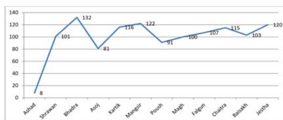
Figure 1. Monthly Trend of Abortion Services. (n=1196)

The total numbers of women of reproductive age were 33151. Total 1196 women have received abortion services and abortion rate was 36.077 per 1000 (15-49 Years women). Most of the women (90%) were more than 20 years of age.