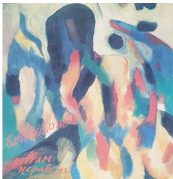
Fig. 3 Expression [Source: Uttam Nepali, 1993, Acrylic on canvas]

The painting Meditation (Fig. 2) arouses the tranquil feeling as Nepali uses cool green and blue colors. Thin red patches come against his cool palate. The mature knowledge of complementary colors developed inside the unconscious mind of an artist can be measured through this painting. One can find the feeling of meditation by observing it. It works like the armchair for the viewer to relax after the hard work. Sometimes, it looks like the distorted form of face with closed eyes. Yellow is representing eyes then immediately the form changes into the form of tree or jungle in front of our eyes. The big area of lemon yellow on the top most part of the painting is balanced by the small form of yellow given in the lower part against flat black planes. This pictorial language proves that there is no need of representation of objective world to communicate joyous feelings.