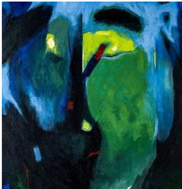
Fig. 2 Uttam Nepali. Meditation , Poster Color, 74 x 58 cm, MoNA Collection

The painting Meditation (Fig. 2) arouses the tranquil feeling as Nepali uses cool green and blue colors. Thin red patches come against his cool palate. The mature knowledge of complementary colors developed inside the unconscious mind of an artist can be measured through this painting. One can find the feeling of meditation by observing it. It works like the armchair for the viewer to relax after the hard work. Sometimes, it looks like the distorted form of face with closed eyes. Yellow is representing eyes then immediately the form changes into the form of tree or jungle in front of our eyes. The big area of lemon yellow on the top most part of the painting is balanced by the small form of yellow given in the lower part against flat black planes. This pictorial language proves that there is no need of representation of objective world to communicate joyous feelings.