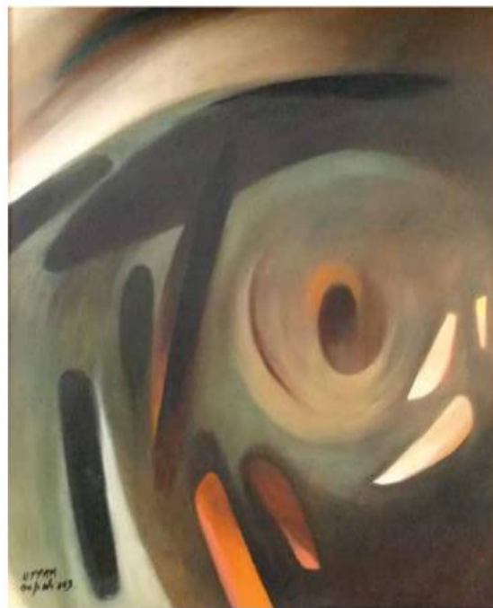
Fig. 6 Uttam Nepali. The Vision , 2003, Acrylic on canvas

This Untitled (fig.5) painting has beauty without any objective representation of natural world. It is painted in yellow, red and olive green color. The yellow circular patches show the warmth and happiness. The circular surface is disrupted by many whimsical lines. These lines show the intense force which overwhelmed the artist while making this painting. His lines are corresponding to the circular shape created by yellow and green transparent patches. This correspondence has their own existence in the pictorial language to create beauty.