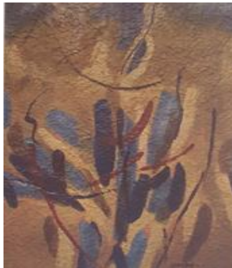
Fig.7 Uttam Nepali Untitled. , 2003, Acrylic on Handmade Paper ,24''x30''

In this painting Untitled (Fig.7), artist gives the patches of blue on yellow ochre. The shapes are made without any materialistic aspects. The texture of lokta paper used as the surface is helping to create vibration in purely visual manner. This earthly color shows his dull mood. Gharti (2015) points out: “He has set his hands on all sorts of art forms, from realistic to complete abstract. However, he found solace in abstract painting” (p.29). The dynamic leaf like forms are amusing and they provide the feeling of dance.