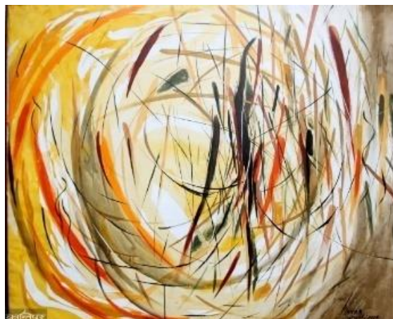
Fig. 5 Untitled [Source: Uttam Nepali, 2000, Acrylic on canvas ]

Nepali’s another painting Untitled (Fig.4) is bright and cheerful. This abstract painting did not rely on motifs drawn from the natural world. The beautiful patches of brilliant red and black float freely on light color. He wanted the contrast of the bright free-flowing colors and the scratchy lines to stir the viewer’s emotion directly. Here the colors came through chance which the artist normally attempted to control in his previous painting. In his exhibition catalogue, Nepali (1997) himself states that “where there is the state of moral creativeness, there is the creation of pleasurable mental environment”. Hence he is able to create pleasurable environment.