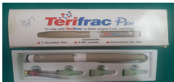
Figure 2: Human recombinant parathyroid hormone analogue 1-34 (Teriparatide: Terifrac (r-DNA origin) 750 mcg/3ml, Intas Pharmaceuticals Ltd, India).

Using a reusable pen, teriparatide was instructed to be injected subcutaneously on the lateral aspect of the thigh. 50 mcg or 20 IU of injection was administered every day at the same time. Side effects of headache and pain on the injection site occurred for a few days but was relieved on plain paracetamol tablets. Total calcium and ionized calcium level started to rise. Thereafter, the daily dose of calcium and calcitriol was gradually decreased. Normocalcemia was restored and symptoms completely resolved. On 2020/08/02, the patient was discharged on injection Teriparatide 50 mcg (20 IU) s/c once a day, tablet calcium carbonate 3 gm/day, tablet calcitriol 0.25 mcg/day and tablet levothyroxine 150 mcg/day. At the time of discharge, patient had stable vitals and lab parameters were: serum Total calcium 10.1 (8.4-10.2) mg/dL, Ionised calcium 1.01 (1.05-1.27) mmol/L, phosphorus 3.6 (2.5-4.5) mg/dL, magnesium 0.98 (0.66-1.07) mmol/L, albumin 4.8 (3.5-5) g/dL, and TSH 14.14 (0.3-4.5) uIU/mL. (see figure 3)