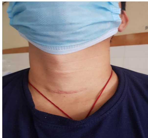
Figure 1: 31 year old male with status post total thyroidectomy, with thyroidectomy scar.

This time (2020/07/08), he was admitted to the department of Internal medicine with the chief complaint of bilateral upper and lower limb tingling sensation, weakness, myalgia, and severe spasmodic pain. At the time of presentation, his physical examination results were normal, except for thyroidectomy scars and carpopedal spasm (see figure 1).