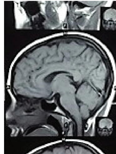
Fig 2. Normal Pituitary MRI after one and half years of treatment

After one month on 4th March 2016, serum prolactin levels dropped to 1152.0 ng/mL (3-18.6 ng/mL), with subsequent improvements in vision and headache. Perimetry test showed normal results. The patient was then prescribed with higher dose of cabergoline 1.25 mg twice a week and was advised to follow up after 3 months. Gradually her serum prolactin dropped down to high normal range after one and half year of treatment. She regained her normal menstrual cycle. On 31st July 2017, her serum prolactin was 19.0 ng/mL and her repeated MRI of brain with pituitary showed complete disappearance of pituitary lesion as compared to earlier imaging (Fig. 2).