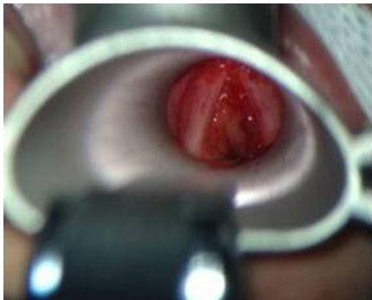
Laryngoscopic picture: proliferative growth involving Left true cord, extending into subglottis