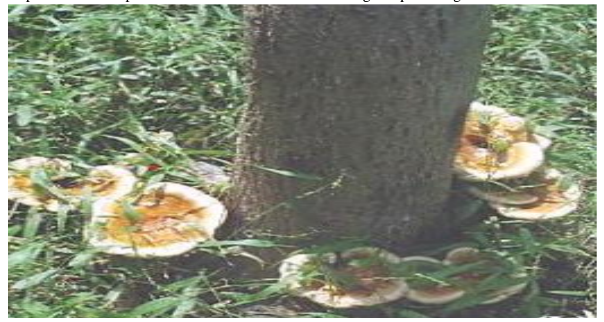
Fig.3. Fruiting bodies of G. lucidum causing root rot in D. sissoo (Bhatia, 2015).

Disease prevention was tested by the treatment of fungicidal seeds and soil alteration with crop residues. The prevention of disease is found with highest percentage of bavistin and