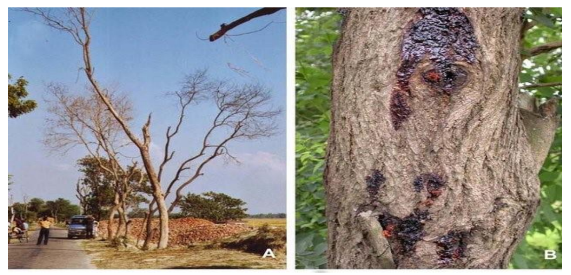
Fig.5. D. sissoo showing symptoms of dieback. A. Adversely affected trees with stag head. B. Black spots on the bark (Muehlbach et al., 2010).

One of the most significant diseases is called dieback wilt by F. Solani f. Sp. Dalbergiae is eclipsed in Dalbergia sissoo . The dieback is distinguished by thinning leaves and crowns in extreme conditions, drying of ends of branches, roofing of table, and a stag-head (Khan & Khan, 2000). In the acropetal succession, the entire tree looks yellow, as shisham wilts yellowing and death of leaves occurs. The infected trees display symptoms of wilting, the leaf shed makes the branches clear in the advanced stages, and plants will eventually die in a few months (Kumar & Khurana, 2016). It can take one month to a year to fully die the tree from above; the tree begins to die from above (Parajuli et al. , 1999).