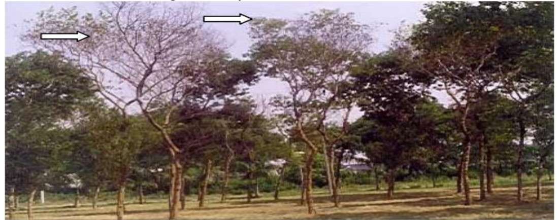
Fig.4. Wilting of shisham tree