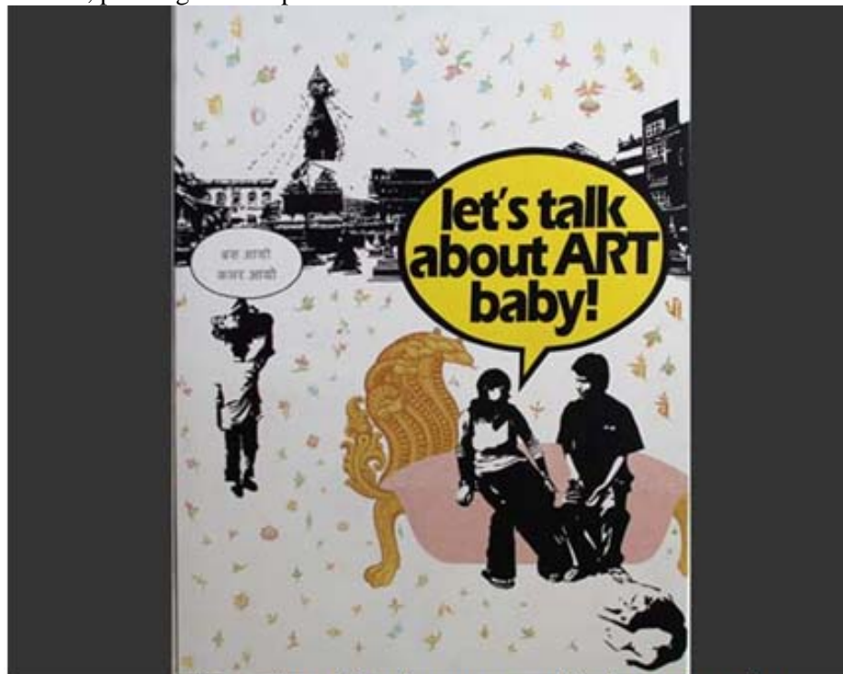
Fig.3 Sujan Chitrakar. 'Let's Talk about Art Baby'

On the top of the bed, the artist has installed sculpture and painting. The boundary between reality and art has been broken. The artist uses the room to hide himself. In the bedroom, we reveal ourselves. The distance between appearance and reality is vanished in the bed. We are something but we become something else through disguise to protect ourselves. There are various purposes of disguise as to show oneself great, to be hypocrite, to be invisible. Through disguise, the insignificant can be shining and famous. The important person can be invisible in disguise. We are living the life of disguise. Our identity is ever shifting rarely revealed. The artist also uses the mask, the other instrument for disguise. We wear mask to hide our face, to become something else what we are not. To disguise himself, the artist uses mask, painting and his private room.