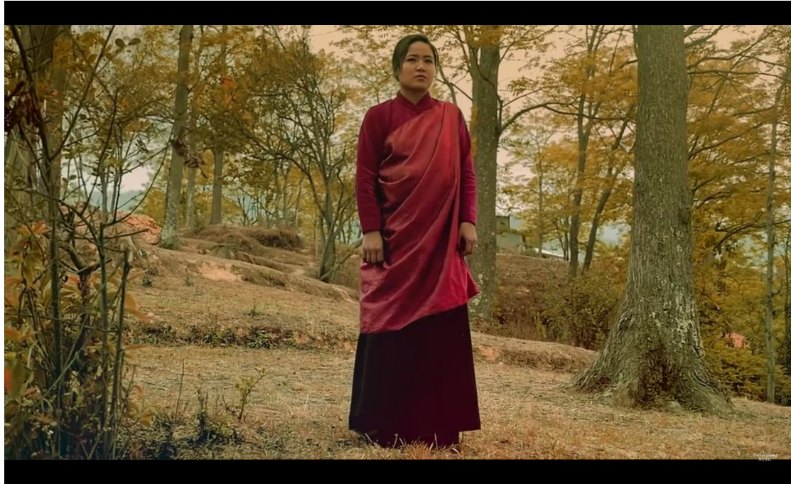
Fig 2: Sajha Ko Bela