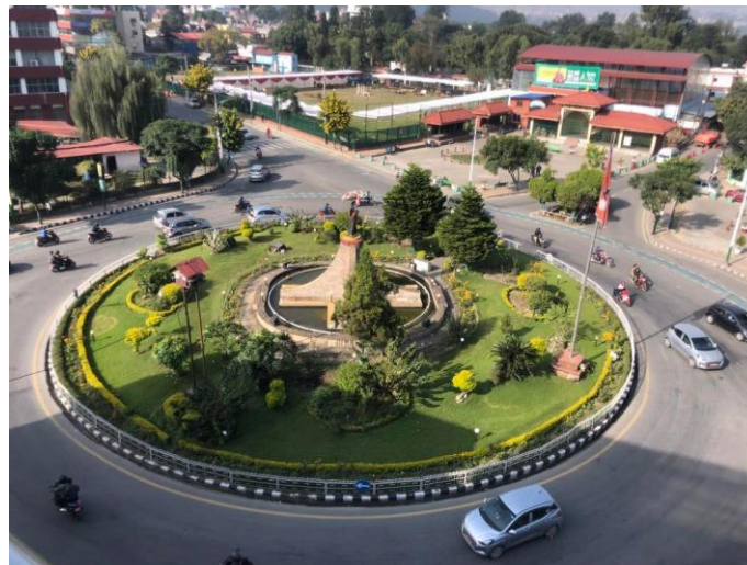
Figure 1 Study area (aerial view of Jawalakhel Roundabout with its cycle lane)

The roundabout at Jawalakhel had been selected for this study. The roundabout at this location is essential in Kathmandu valley and is often busy in the morning and evening as the location consists of major institutions, markets, places, and hospitals. This is an un-signalized roundabout with four approaches namely Pulchowk, Lagankhel, Ekantakuna and Zoo.