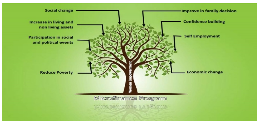
[Fig. 1: Role of microfinance for women empowerment]

Microfinance creates lot of opportunities in economic sector such as: stimulating growth of economy, increasing volume, accessibility and outreach, and women empowerment. It has positive impact to clients of microfinance in loan transaction, income and saving, living and non-living assets, food self-sufficiency, clothing and housing, health care, education for children, participation in social and political events and empowerment of women. There is positive improvement in investment, income, saving, and increase both living and non-living assets. There is also remarkable improvement in housing, health care, and education of children. Participation in social and political events and found significant positive changes in the empowerment of women on the whole after involvement in microfinance group compared before status. The main role of microfinance for women empowerment has been shown in figure 1.