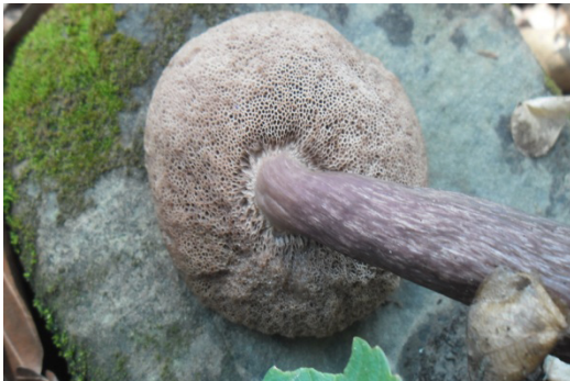
Buwaldo boletus spp.