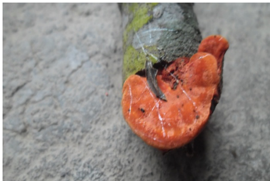
Pycnoporous cinnabarinus (Jacq.:Fr)Karst.