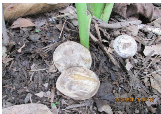
Dictyophora indusiata (Vent.) Desv.