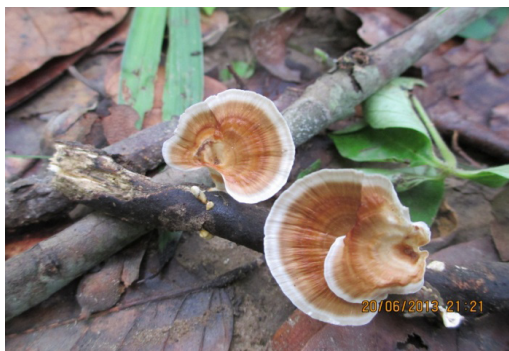
Microporus xanthopus (Fr.) Kuntze