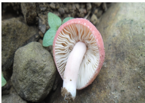
Russula emitica (Sch.:Fr)Pers.