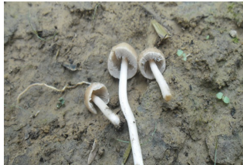
Coprinus disseminates (Pers.) J.E.Lange