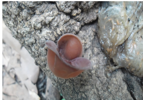
Auricularia auricula-jude (Bull.) J.Schröt.