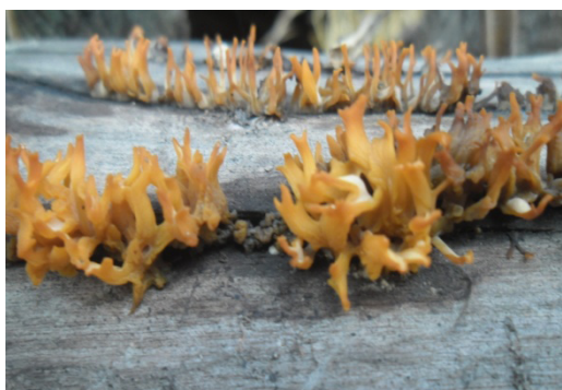
Guepinia spathularia (Schwein.) Fr.