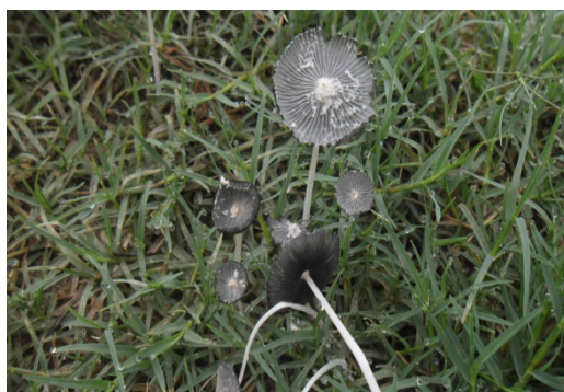
Coprinus plicatilis Fr. ex Curtis