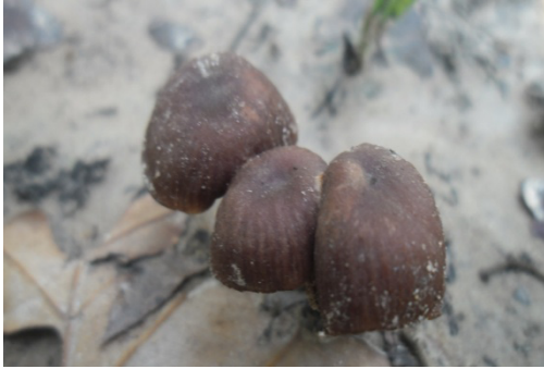
Laccaria laccata (Scop.) Cooke