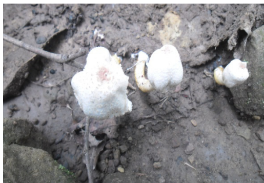
Macrolapiota (Scop.) Singer