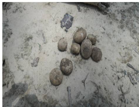
Scleroderma taxiens Berk.