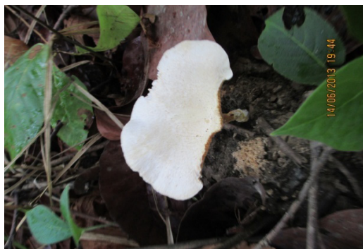
Polyporus durus (Timm.)Kreisel.