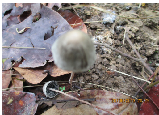
Coprinus comatus (Mull.:Fr)Pers.