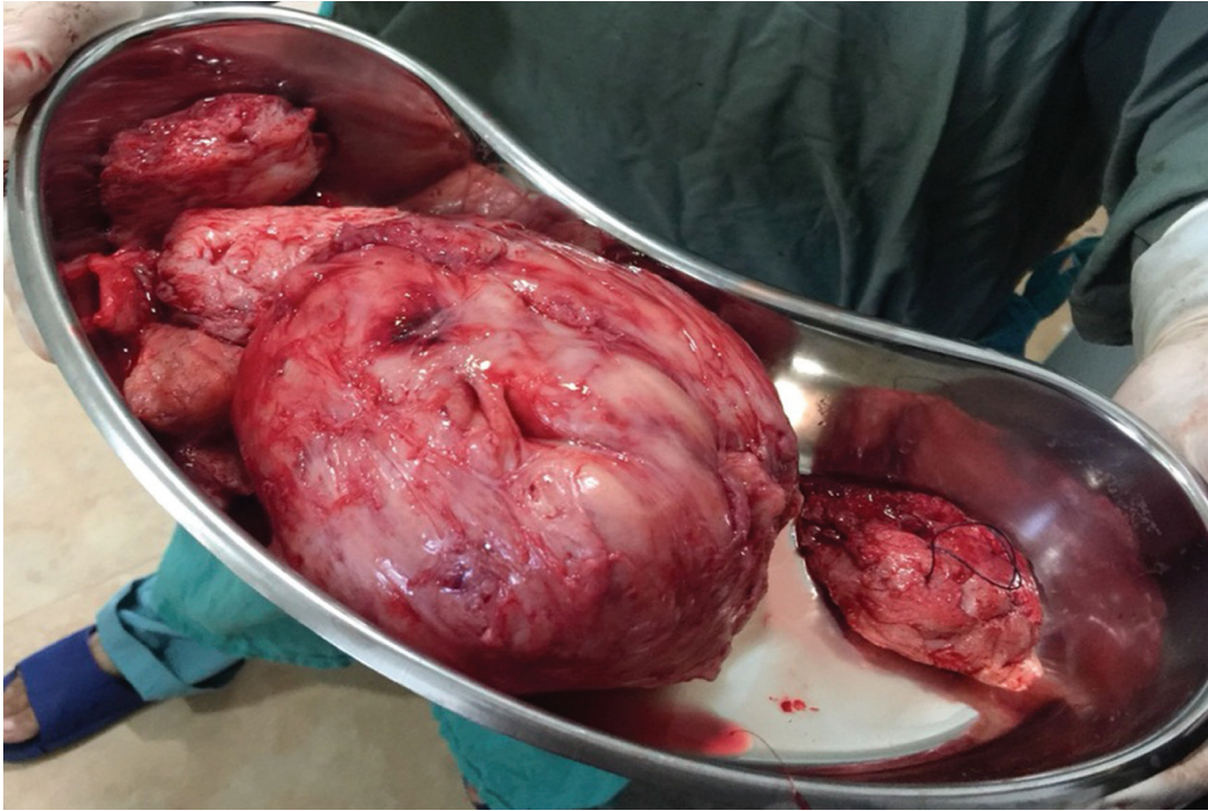
Figure 1: The excised mass on gross examination revealed grey white nodular tissue measuring 13.5x8x2.5 cm. Cut section showed grey white areas with whorled appearance.